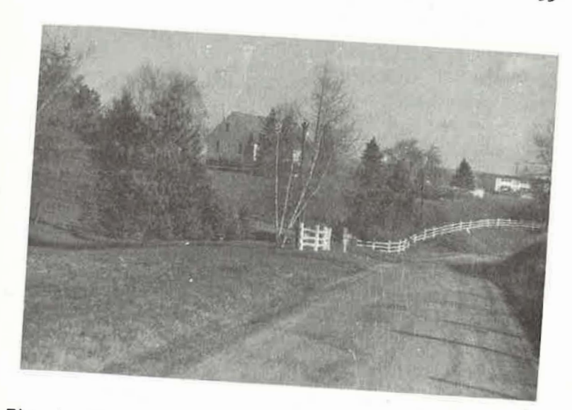
Fig. 1. Our home. The pond pines are on the left where our main netting used to be done.

Nov. 12 .... This proved to be the last day for the fall chickade migration (it lasted 26 days). A total of 154 were banded during this period. I have always considered a chickadee with a tail length of 59 mm or over to be a Black-cap and anything 57 mm or under to be a Carolina. Stephen W. Simon had a very good article on chickadee measurements in the Jan.-Feb. 1960 issue of EBBA News. Eight of the 154 banded this fall had a tail length of 58 mm, and since they were traveling with known Black-caps, I felt they were Black-caps also. Three had a maximum tail length of 66 mm. The average tail length for the 150 that were measured was 61.347 mm. Practically all the chickade