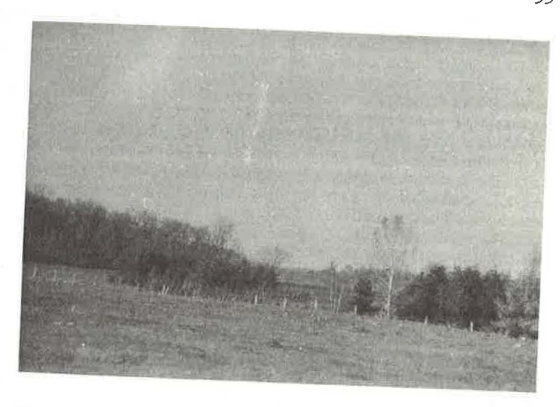
Fig. 3. Pines in left center field where I now do most of my netting.

Dec. 26 .... This was the day selected for our Christmas count. A beautiful sunny day but cold compared to the many mild days this fall. We had a very unusual bird on our list of 41 species - a Barn Swallow. It is not even listed on the remittance sheet to be sent to Christmas Count headquarters. I thought about omitting it from the list (because to it is only natural for anyone that studies birds seriously to question