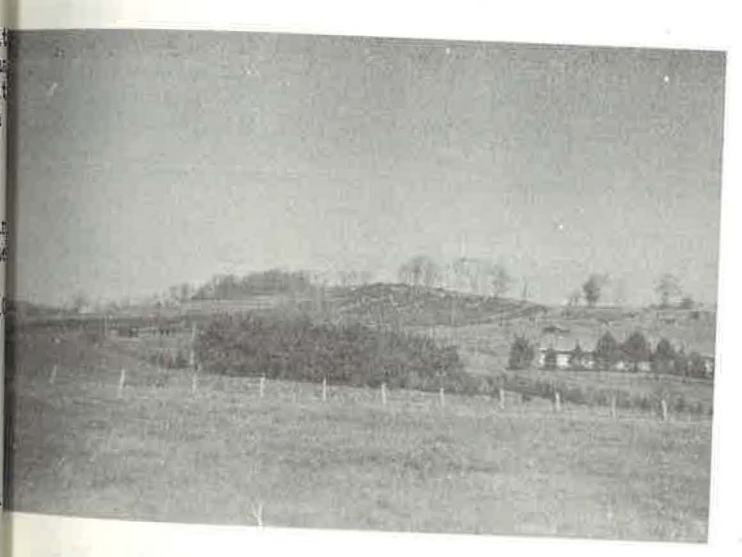
4. The same picture as above only from a different angle.