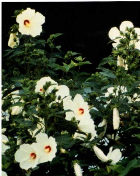
Above: Canoeing at Prime Hook, photo by Marian Pohlman. Right: Swamp Mallow, photo by Shireen Gonzaga.

Four trails and four State highways which transect the refuge afford the visitor an ideal opportunity to observe and photograph a variety of wildlife and plants. Please remember that the taking of any plant or animal without a permit is prohibited. Many species may be observed relatively undisturbed in their natural habitat.