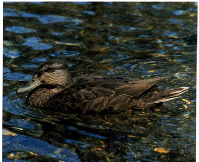
Below: Black duck, USFWS photo.

The Service also manages national fish hatcheries, and provides federal leadership in habitat protection, technical assistance, and the conservation and protection of migratory birds, certain marine mammals and threatened and endangered species.