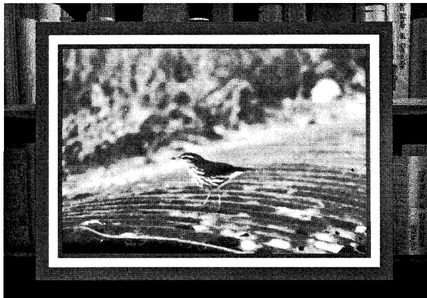
Northern Waterthrush ( Seiurus noveboracensis ) - Headlands Beach State Park by Larry Rosche

Lorain mudflat on Sep. 3 (Hannikman, Hoffman, LePage).