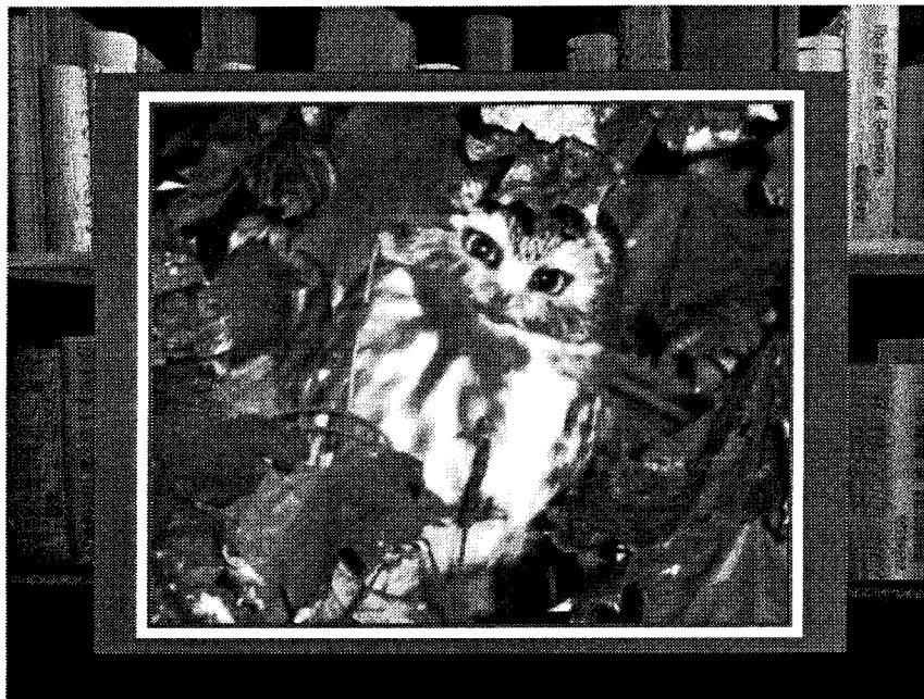
Northern Saw-whet Owl ( Aegolius acadicus ) - Cleveland - Nov. 13, 1995 by Scott Wright