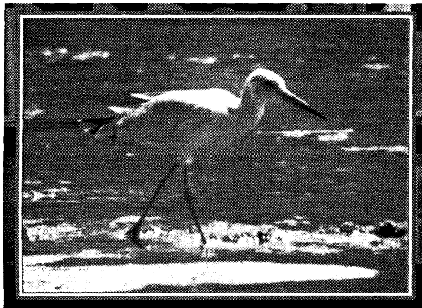
Willet ( Catoptrophorus semipalmatus ) - Conneaut Harbor by Scoff Wright

NORTHERN SHRIKE - One was in West Farmington on Oct. 29 (Augustine). A juvenile dawdled in the dunes area of Headlands