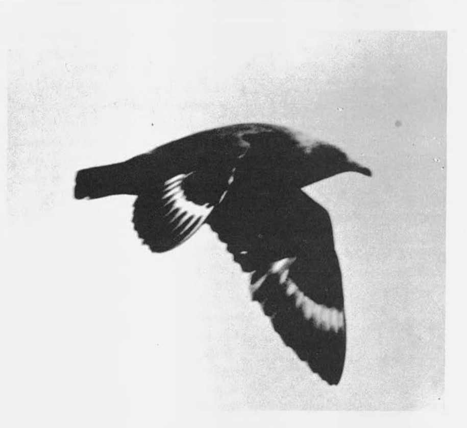
Figure 2. South Polar Skua