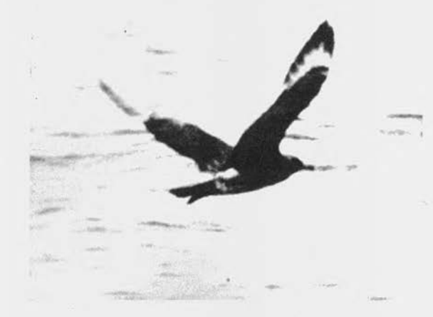
Figure 1. Pomarine Jaeger

As the proper identification of skuas and jaegers is hardly a novel field problem, I would like to explain my identification of the bird in question, referring to two of Taylor's photographs of that bird (Figures 1 and 3), and to my photograph of a South Polar Skua.