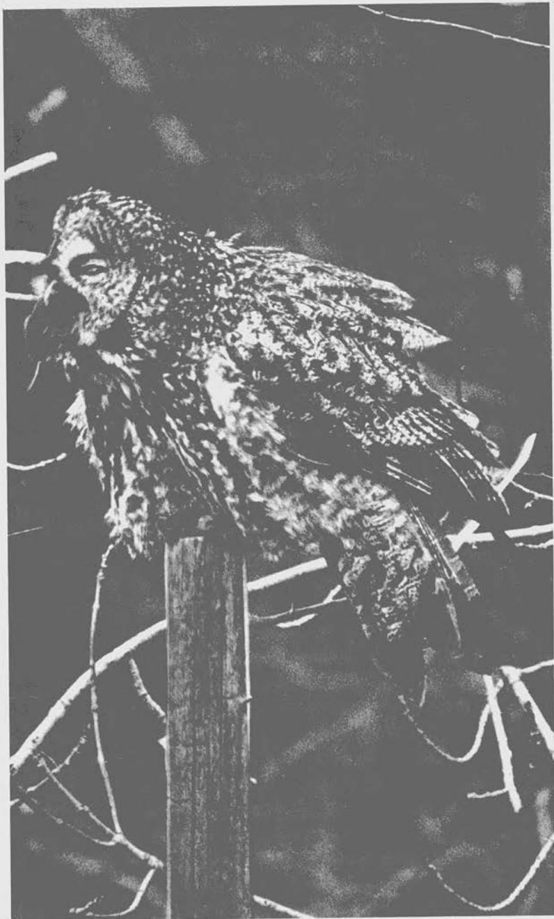
Great Gray Owl swallowing meadow vole, Ipswich River Wildlife Sanctuary, Topsfield, Massachusetts, January 30, 1979.