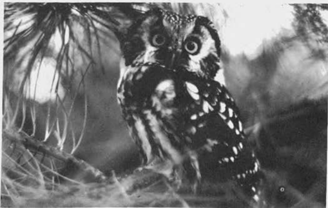
Boreal Owl, Salisbury, Massachusetts, December 31, 1978