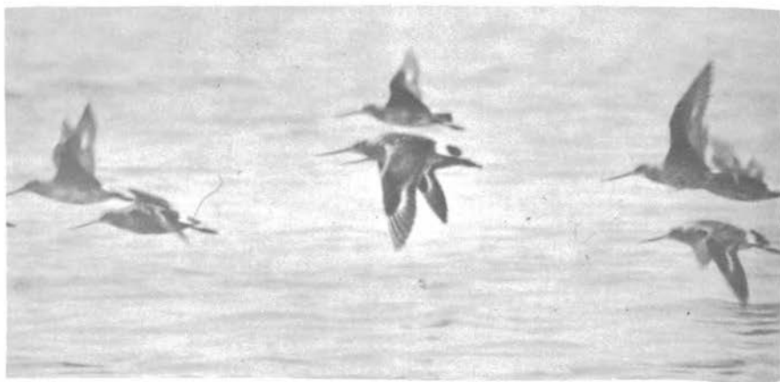
Hudsonian Godwits in flight, on Monomoy, August 1977.