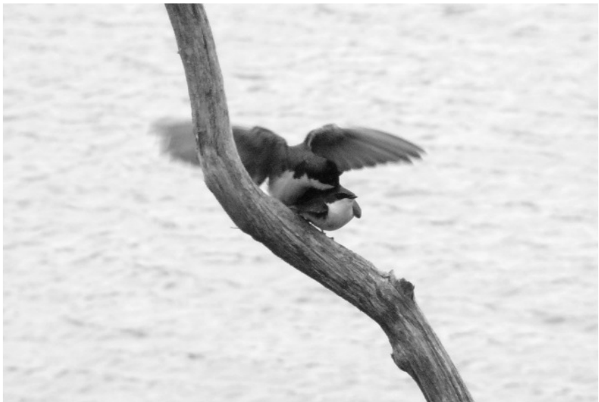
TREE SWALLOWS