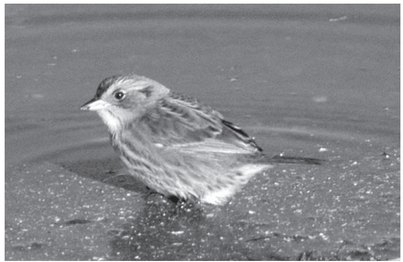
Figure 2. Sharp-tailed sparrow at Great Meadows NWR.

The underparts of the Great Meadows bird were virtually colorless, lacking the bright buffy-ochraceous tones across the breast and along the flanks that are typical of A.n. nelsoni . In this respect the bird was most similar to the dullest form of Nelson's, A.n. subvirgatus , except for the fact that the streaks in these areas were relatively bold, a trait that all but ruled out all three forms of Nelson's. But, while the breast and flank streaks were bold like those of a Saltmarsh, they were, at the same time, somewhat blurry, unlike the rather crisp streaks of a typical Saltmarsh. The bill shape appeared to be intermediate between nelsoni and Saltmarsh, being neither as short as nelsoni nor as heavy as Saltmarsh. The color in the base of the mandible appeared yellowish, a feature consistent with Saltmarsh. The upperparts were a flat gray, and the whitish back streaks typical of this group were rather weak.