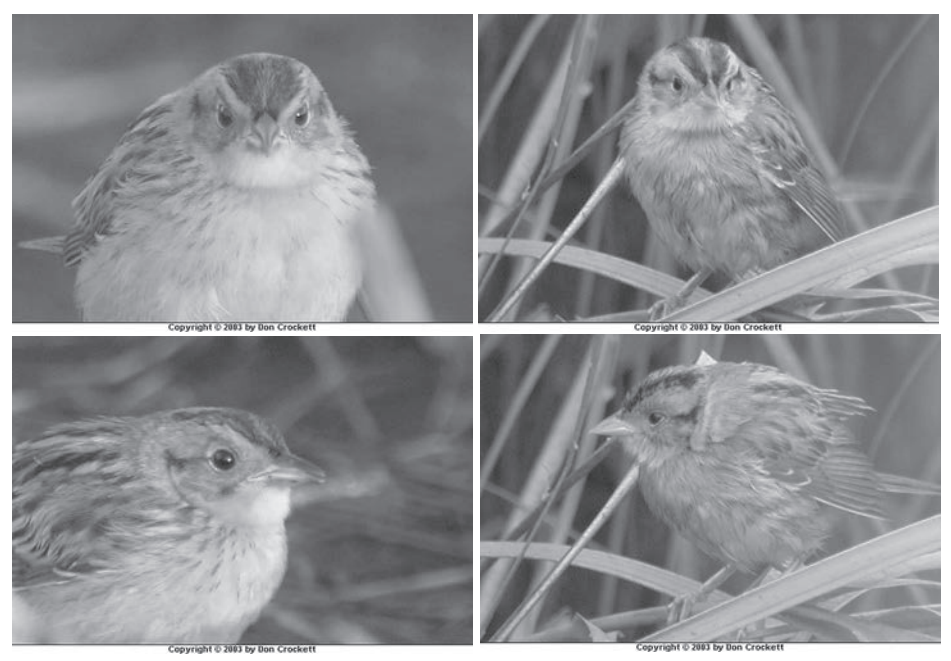
Images of juvenile Saltmarsh (left) and Nelson's (right) Sharp-tailed Sparrows

During the past breeding season I looked at, or listened to, more than 400 different Saltmarsh Sharp-tailed Sparrows at various locations while trotting around in the marshes of Newbury, Newburyport, Salisbury, and Rowley, and found six nests. I did not find any Nelson's Sharp-tailed Sparrow nests.