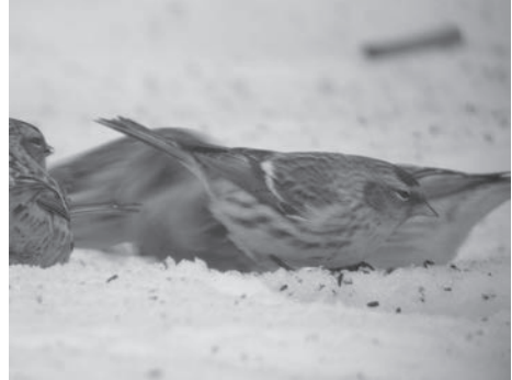
Above right . Common Redpoll ( Carduelis flammea flammea ). Notable by its longer-billed appearance, well-defined auriculars, dull brownish-white fringes to remiges and retrices, and rather heavy flank streaking. Interestingly, the pure white undertail coverts of a Hoary Redpoll can just be seen to the rear and right of the Common Redpoll's head. James P. Smith, December 2003.