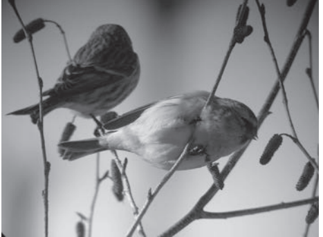
Above right. Male Hoary Redpoll ( Carduelis hornemenni exilipes ). Note the clarity of the white underparts, minimal flank streaking, and virtually unmarked undertail coverts. Why male? The color image shows a light pink wash on the upper breast, ruling out female and first-winter exilipes . Compare the flank streaking with the much darker Common Redpoll at the rear. James P. Smith, December 2003.