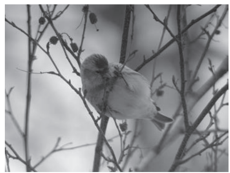
Above right. Male Common Redpoll ( Carduelis flammea flammea). An exceptionally pale bird for flammea, especially on the undertail coverts and about the face, and therefore a pitfall for the unwary. However, only male Common Redpoll can show such an obvious red upper breast in midwinter. The breast of a male Hoary would at best, be very faintly washed pink (not red) in late December, making the identification of this fine male straightforward.