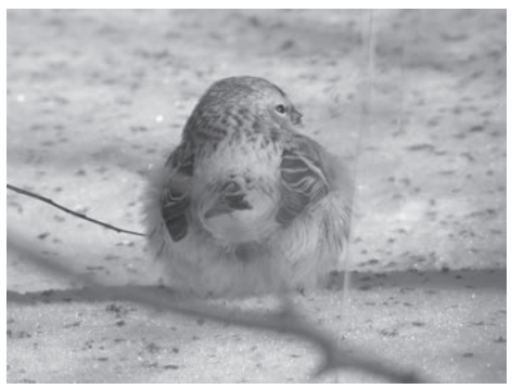
Above left. Hoary Redpoll ( Carduelis hornemenni exilipes ). A classic bird showing off its very best features. Almost spherical at times, such birds give rise to the oft-quoted "flying snowball" appearance. Especially noteworthy are the uppertail coverts (broadly fringed white) and the way that the white of the upper rump extends well into the lower back and deep into the center of the mantle. James P. Smith. December 2003.