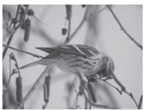
Above left. Common Redpoll ( Carduelis flammea flammea ). A typical individual with overall brownish cast, heavily streaked flanks, and extensively streaked undertail coverts. Note the dull brownish-white fringes on the remiges. It is also worth noting how narrow and dull the fringes of the uppertail coverts appear when compared with those of Hoary Redpoll. James P. Smith, December 2003.