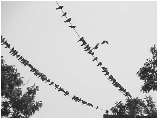
AUGUST SWALLOWS BY DAVID LARSON

adult alternate banded breeding dark (morph) female fledgling immature juvenile light (morph) male maximum migrating nesting photographed plumage pair summer (1S = 1st summer) various observers winter (2W = second winter) young additional observers