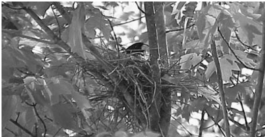
ROSE-BREADED GROSBEAK NEST BY DAVID LARSON

The full report is available on-line at < http://library.fws.gov/nat_survey2001_birding.pdf >.