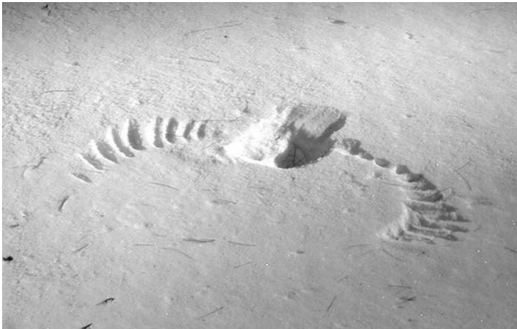
OWL PRINT IN THE SNOW

Mt. Auburn Cemetery, Cambr. Nine Acre Corner, Concord New England Hawk Watch Newburyport Oxbow National Wildlife Refuge Plum Island Pond Provincetown Pontoosuc Lake, Lanesboro Race Point, Provincetown Reservoir South Dartmouth South Beach, Chatham Sandy Neck, Barnstable Sudbury River Valley South Shore Bird Club Take A Second Look Boston Harbor Census Wellfleet Bay WS Wachusett Meadow WS Worcester Wildlife Sanctuary