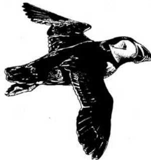
ATLANTIC PUFFIN BY ANON.