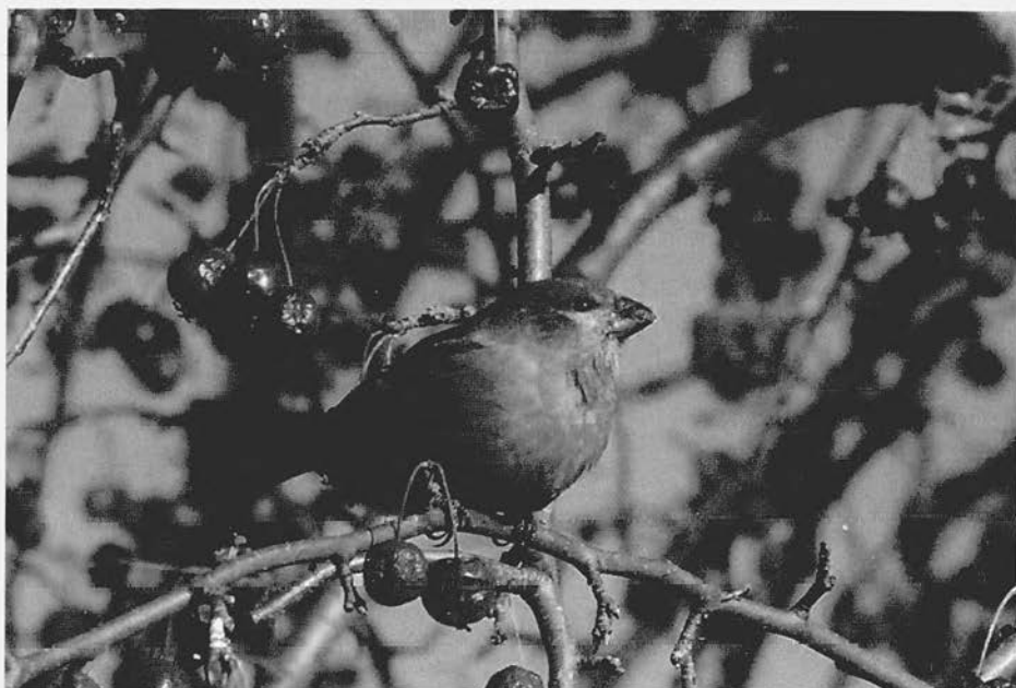
PINE GROSBEAK, JIM SWEENEY