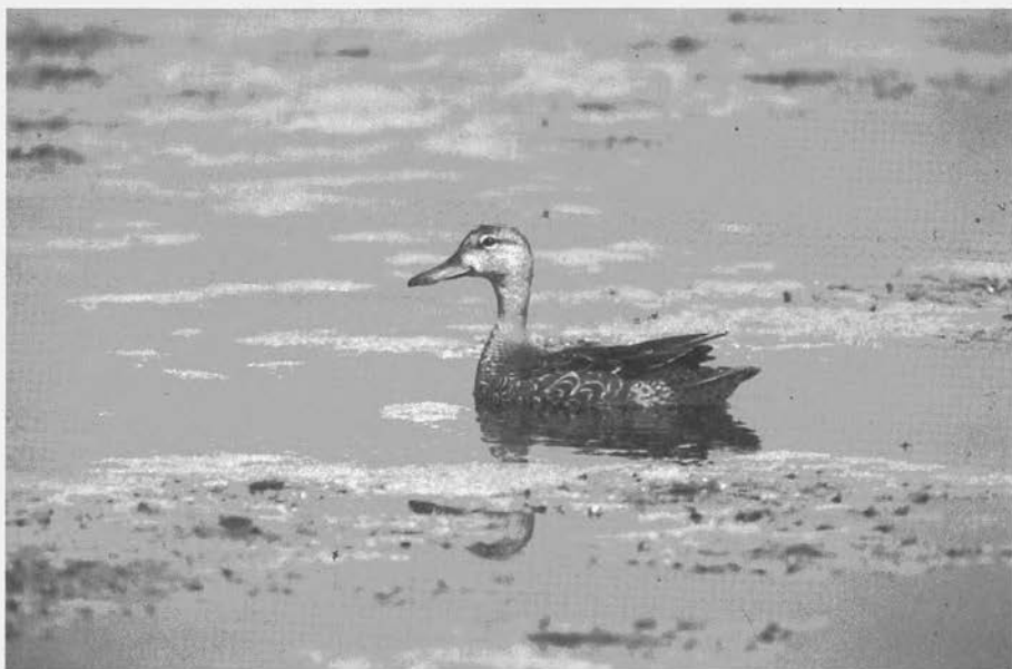
ROGER S. EVERETT

Last month's mystery bird proved to be a sea duck, specifically a Surf Scoter. It may be remembered that among the distinguishing features of many sea ducks are relatively thick necks, chunky bodies, oftentimes broad-based bills, and in some species (e.g., scoters, Harlequin Duck, Long-tailed Duck), prominent facial markings. With this in mind, it should be fairly obvious that April's mystery species, while clearly another duck, is not another sea duck. Furthermore, the slim proportions and well-patterned feathers on the sides and flanks indicate that the bird is a puddle duck, rather than a diving duck such as a scaup, Ring-necked Duck, Redhead, or Canvasback.