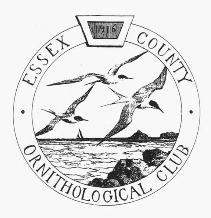
Logo of the Essex County Ornithological Club by Frank Benson

that offers a glimmer of hope for conserving the diversity and abundance of birds that Essex County at one time hosted.