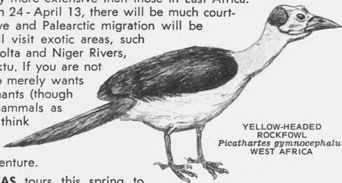
YELLOW-HEADED ROCKFOWL Picathartes gymnocephalus WEST AFRICA

Other BIRD BONANZAS tours this spring to Central America, Northern India and Nepal, and Ethiopia will be led by equally qualified ornithologists. For additional information send the following coupon.