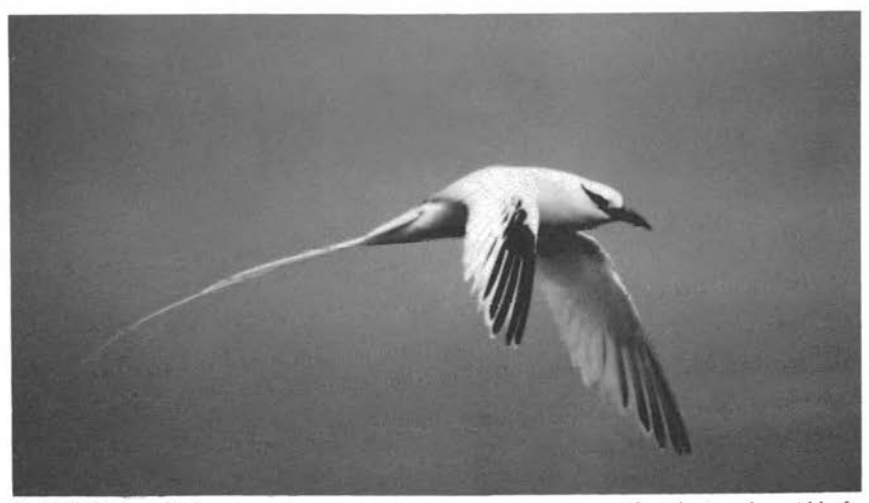
Red-billed Tropicbird Martha's Vineyard, MA September 15, 1986

Aside from the temporal similarities of these events, the physical appearances are also noteworthy. Both records are of adult-plumaged birds in an apparently healthy condition with full tail streamers and very pale dorsal barring.