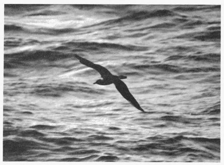
Figure 2. Dorsal view of juvenile Long-tailed Jaeger