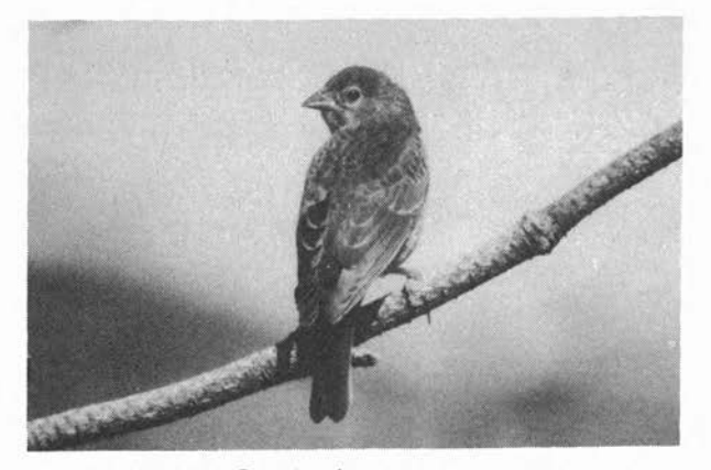
Brown-headed Cowbird

Considering the above, species which should be considered when trying to identify the mystery bird might include the females of the House Finch and the Indigo Bunting, along with the juvenile Brown-headed Cowbird. The bill of a House Finch would likely show a more curved culmen, giving the bill a stubby and thick-based appearance. Likewise, a female House Finch would show dorsal streaking, not scaling. The female Indigo Bunting shows an unstreaked back - a back that under most circumstances looks remarkably even in tone. Thus, we are left with juvenile Brownheaded Cowbird as the AT A GLANCE species. The bird's combination of uniform, drab appearance, finch-like bill, faint wing bars, and an obviously scaly back all typify Molothrus ater. If we could see the underparts, we would find faint gray breast streaks on an otherwise light gray breast. While familiar enough when observed begging food from a smaller songbird, the lowly cowbird can also be seen to present a field problem when seen out of context. The individual pictured was W.R.P. photographed at Monomoy in early September.