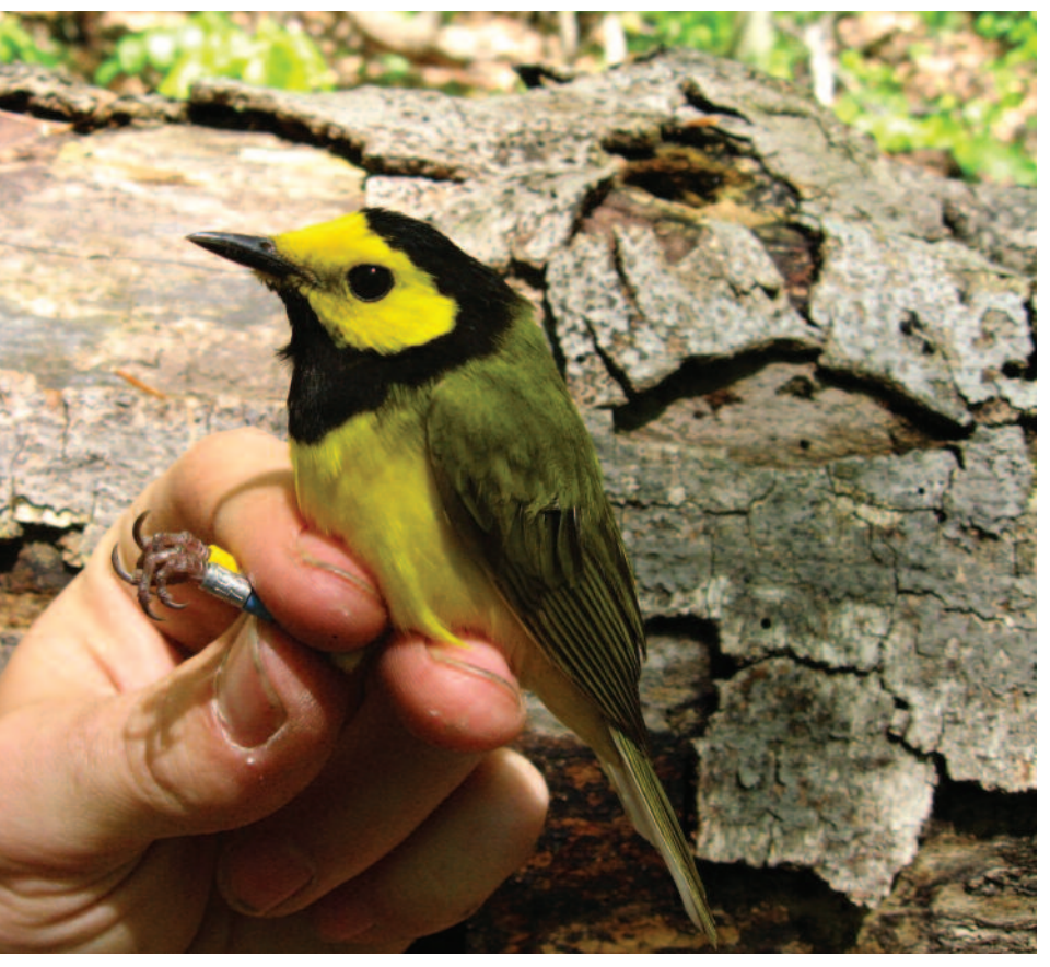
Figure 5. An after second year male Hooded Warbler banded as part of research in the Ganaraska Forest.

adversely affect nest productivity or the interannual survival of individuals of this new population, continued population growth and expansion will occur in this Great Lakes-St. Lawrence Forest Zone population.