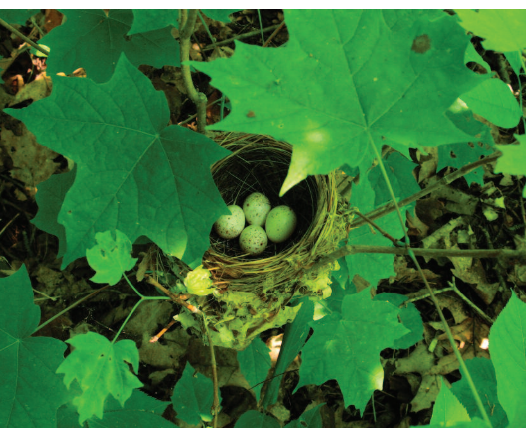
Figure 3. Hooded Warbler nest containing four eggs in a sugar maple sapling, the most often used nesting substrate in the Ganaraska Forest.

percent cover class, they were distributed around class 2 (1 - 25%). Nest sites were distributed around class 3 (26 – 50%), suggesting that Hooded Warblers in the Ganaraska Forest choose a denser understory. The variables that were significantly different between nest sites and non-use sites were: (1) live sapling abundance; (2) dead sapling abundance; (3) shrub density, and (4) mean distance to saplings.