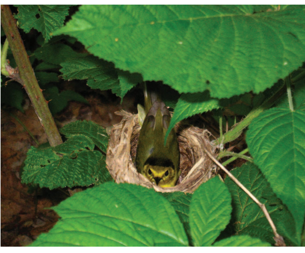
Figure 4. Female Hooded Warbler incubating eggs that included the first observed case of Brown-headed Cowbird parasitism in the Ganaraska Forest.