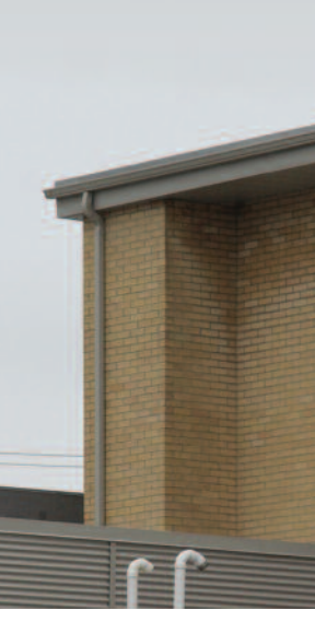
Figure 4. A swift chimney occupied annually by swifts during the nesting season, London, Ontario, 19 July 2007.