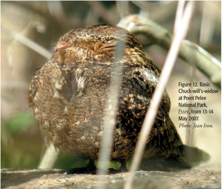
Figure 12. Basic Chuck-will's-widow at Point Pelee National Park, Essex, from 13-14 May 2007.