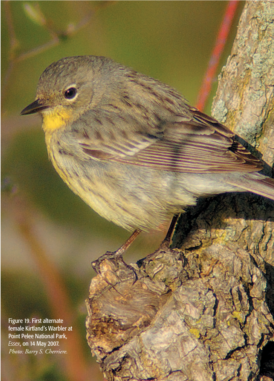
Figure 19. First alternate female Kirtland's Warbler at Point Pelee National Park, Essex, on 14 May 2007.