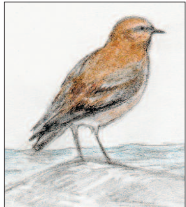
Figure 15. Northern Wheatear at Nepean, Ottawa, on 19 October 2006.