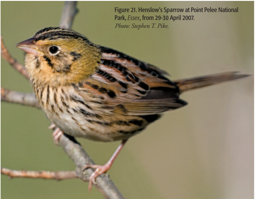
Figure 21. Henslow's Sparrow at Point Pelee National Park, Essex, from 29-30 April 2007.