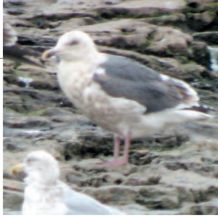
Figure 9. Slaty-backed Gull in third basic plumage at Niagara Falls, Niagara , from 2-13 December 2006.