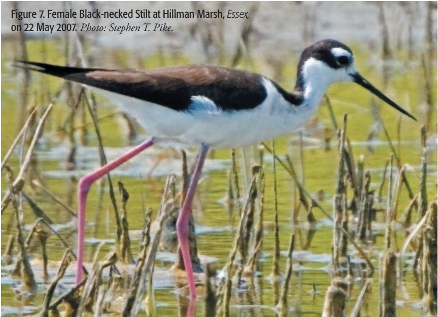
Figure 7. Female Black-necked Stilt at Hillman Marsh, Essex , on 22 May 2007.