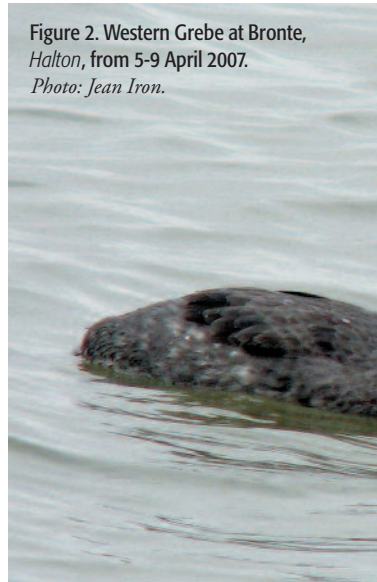
Figure 2. Western Grebe at Bronte, Halton, from 5-9 April 2007.