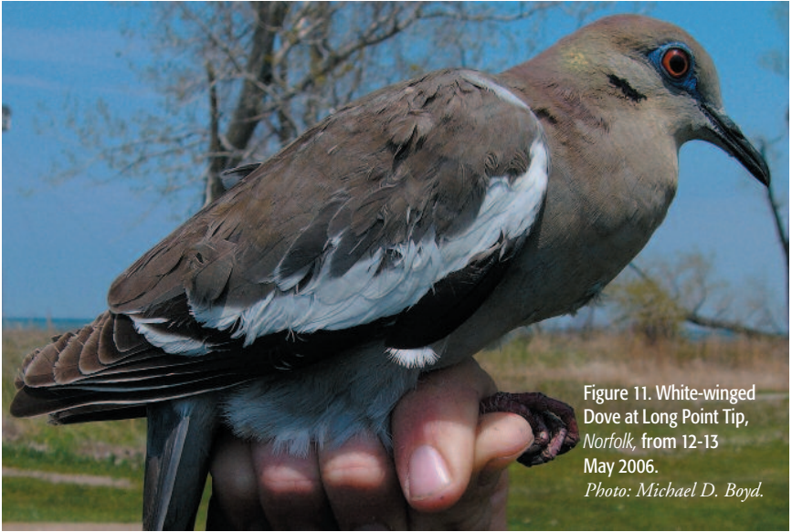
Figure 11. White-winged Dove at Long Point Tip, Norfolk, from 12-13 May 2006.