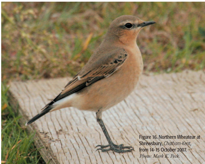
Figure 16. Northern Wheatear at Shrewsbury, Chatham-Kent, from 14-15 October 2007.