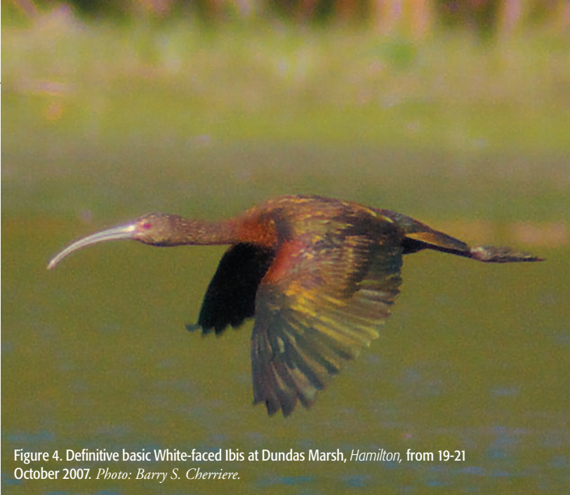
Figure 4. Definitive basic White-faced Ibis at Dundas Marsh, Hamilton , from 19-21 October 2007.