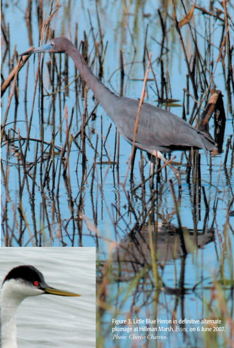
Figure 3. Little Blue Heron in definitive alternate plumage at Hillman Marsh, Essex , on 6 June 2007.