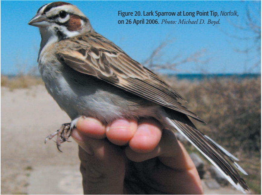
Figure 20. Lark Sparrow at Long Point Tip, Norfolk, on 26 April 2006.