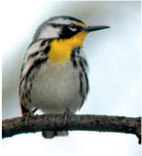
Figure 18. “Yellow-lored” Yellow-throated Warbler at Stoney Creek, Hamilton , from 26-30 April 2007.

This subspecies, the more southern of the two continental subspecies recorded so far in Ontario, has only two previous accepted records for the province: 14 October to 13 November 1982, Moosonee, Cochrane (James 1983), and 12 November to 4 December 1993, Sault Ste. Marie, Algoma , (Bain 1994); details of the Moosonee bird were previously published (see McRae and Hutchison 1983). There are two undocumented records that have yet to be adjudicated by the OBRC: 13 August 1971, Hamilton, Hamilton (Curry 2006), and 8 September to 3 October 1993, Teeswater, Bruce (Wormington 2008).