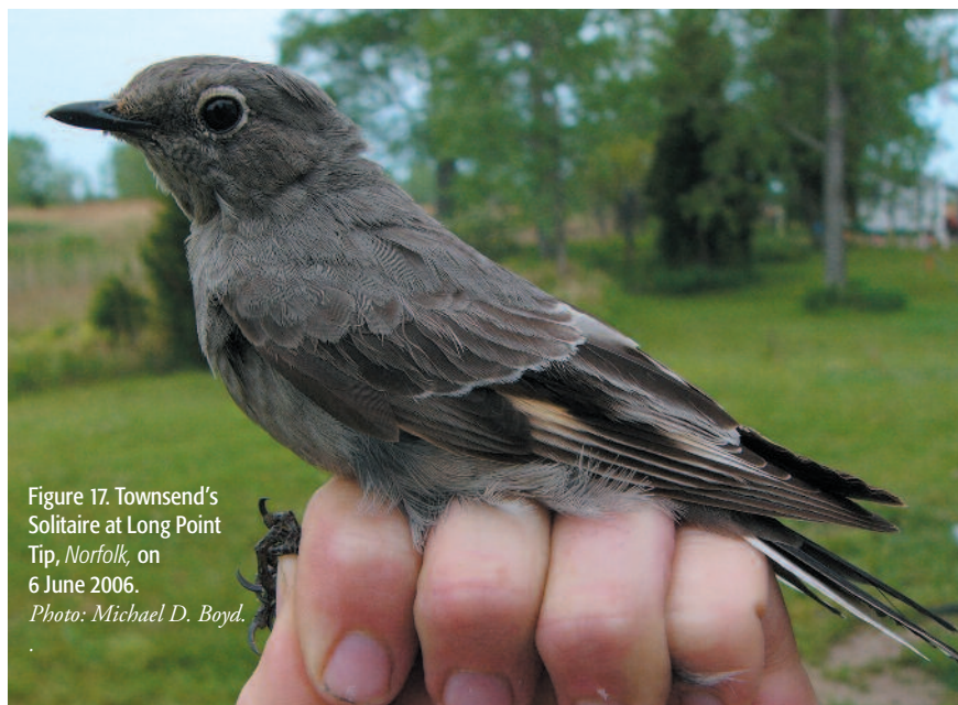
Figure 17. Townsend's Solitaire at Long Point Tip, Norfolk, on 6 June 2006.