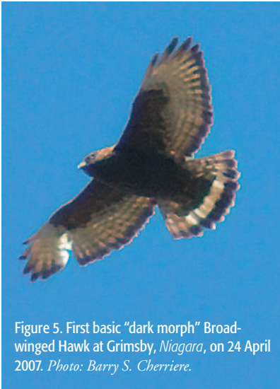
Figure 5. First basic “dark morph” Broad-winged Hawk at Grimsby, Niagara , on 24 April 2007.