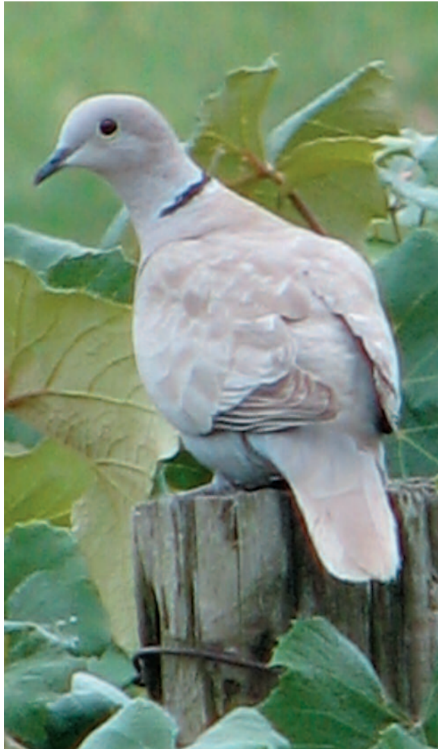
Figure 10. Male Eurasian Collared-Dove at Vinemount, Hamilton , from 17 July – 1 September 2007.