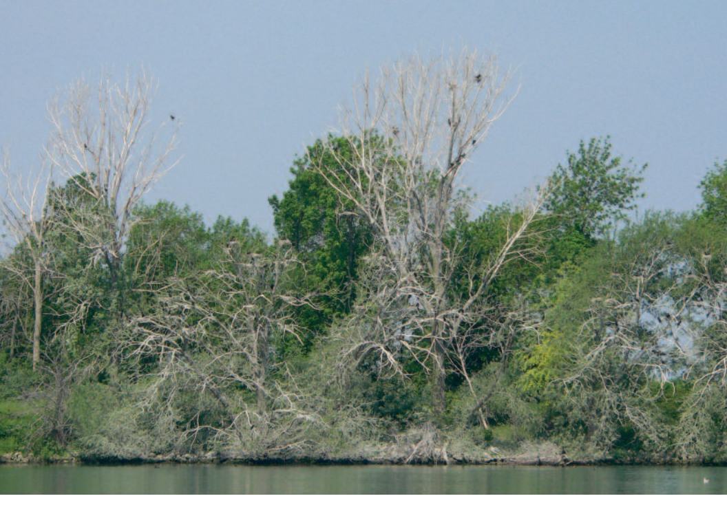
Figure 7. Damage to west side trees from cormorant guano, Welland Canal, Port Weller, 6 August 2008.

Dobos pers. comm.), (Potter et al. 2013). A solitary bird that was found along the west pier during the SCCBC on 16 December 1984 (Drennan 1985) would appear to be the very first cormorant to ever attempt to over-winter at Port Weller. This count is always conducted in mid-December of each year. The NFCBC commenced in 1966 and takes place every year in the fourth week of December almost always between Christmas Day and New Year's Day. From 1966 to 1988, in these first 23 counts, no cormorants were observed. Two individuals observed on the east pier on 23 December 1989 (LeBaron 1991) were the first birds of this species ever located on a NFCBC and over the 26 year period 1989-2014, 734 cormorants were recorded. Of these, 558 were observed at Port Weller with a