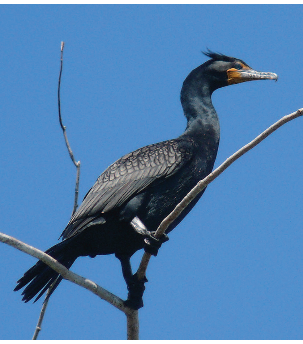
Figure 3. Adult Double-crested Cormorant in alternate (breeding) plumage, 6 May 2010. As the name implies, breeding adults develop a small double crest of stringy black feathers or plumes (white on birds on the Pacific Coast and western North America) at the top of and on each side of the head. The bird often swims low in the water with only its neck and head visible. When feeding, it dives from the water surface and swims underwater, propelled by its feet as it chases its prey. The bird's legs and webbed feet are black.