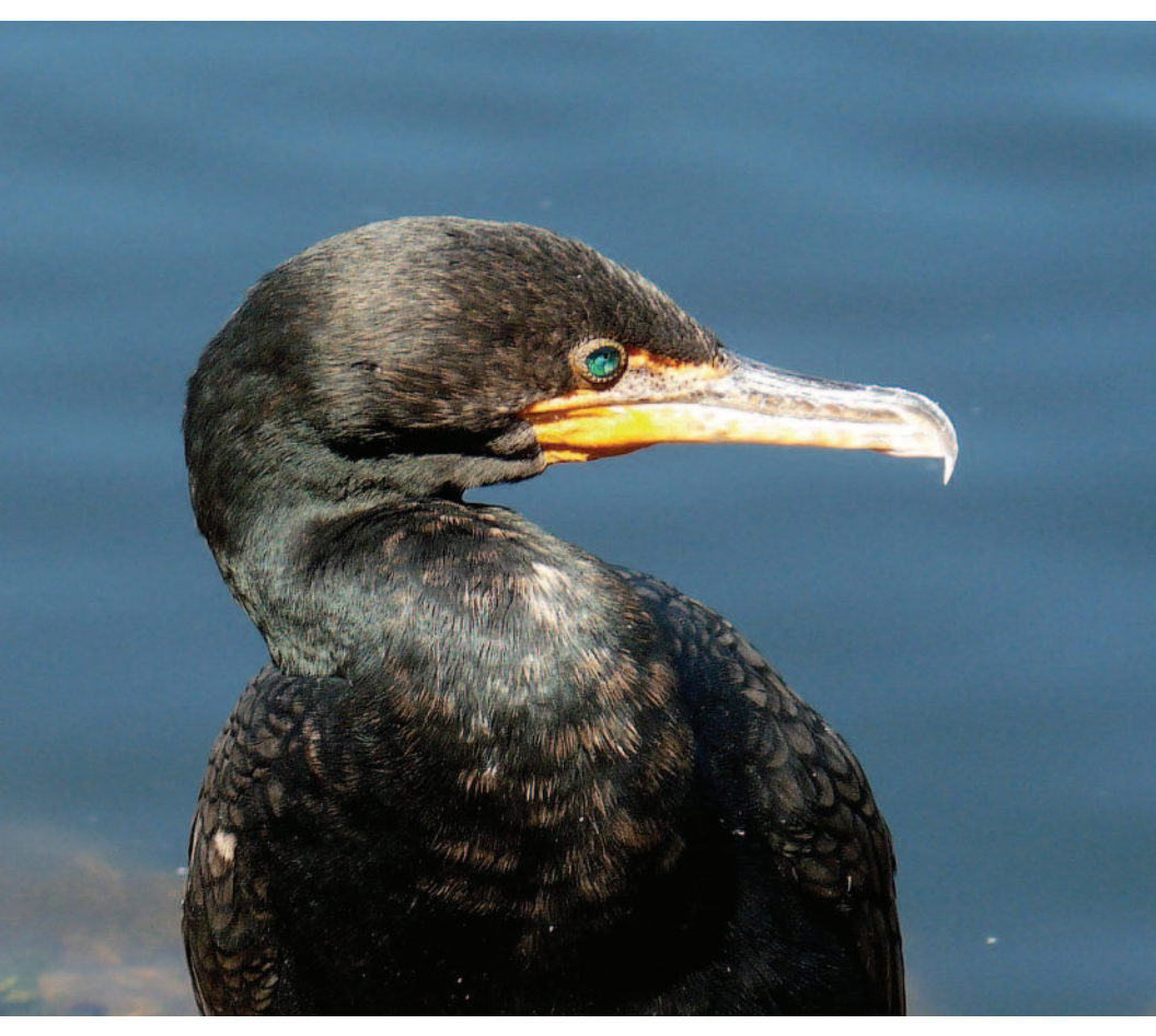
Figure 2. Adult Double-crested Cormorant, 18 February 2010.