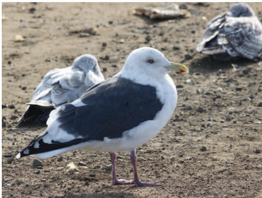
Figure 8: Slaty-backed Gull, Thunder Bay, Thunder Bay on 8 November 2013.