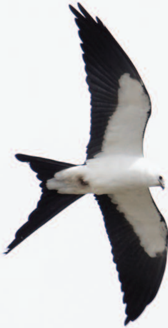
Figure 6: Swallow-tailed Kite, Port Alma, Chatham-Kent on 4 May 2013.