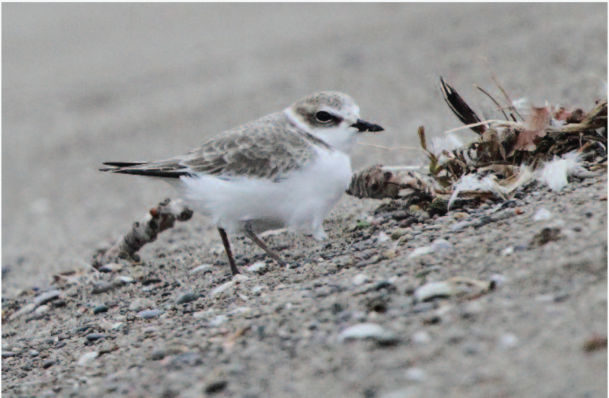
Figure 7: Snowy Plover, Point Pelee National Park, Essex on 1 November 2013.