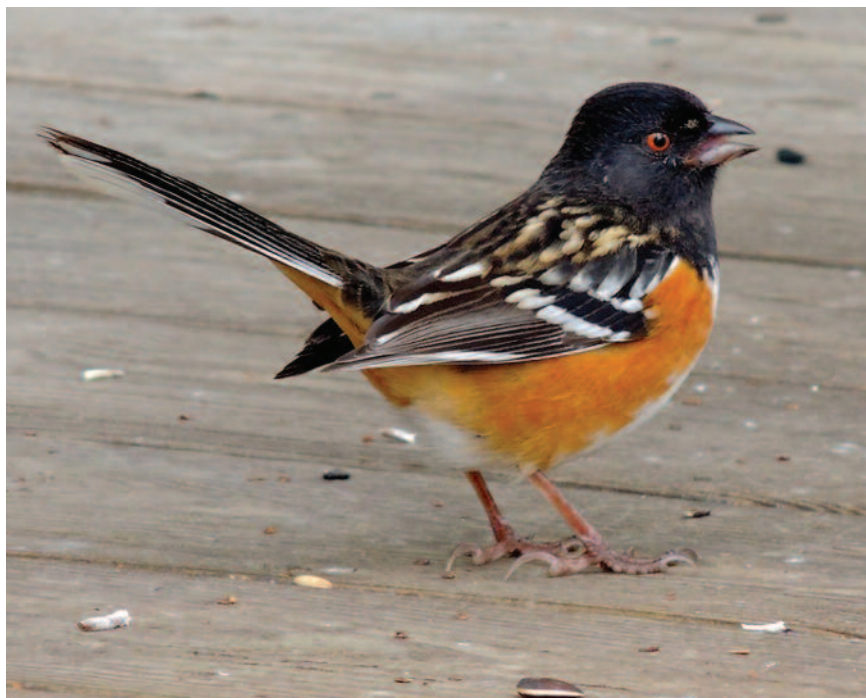
Figure 14: Spotted Towhee, Glenn Williams, Halton on 18 January 2014.