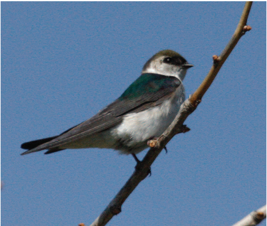
Figure 13: Violet-green Swallow, Britannia, Ottawa on 25 April 2013.

This is the first record for southern Ontario. The first provincial record was at Thunder Cape, Thunder Bay on 28-29 October 1992 (Bain 1993)