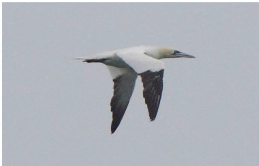
Figure 4: Northern Gannet, Stoney Creek, Hamilton on 1 September 2013.