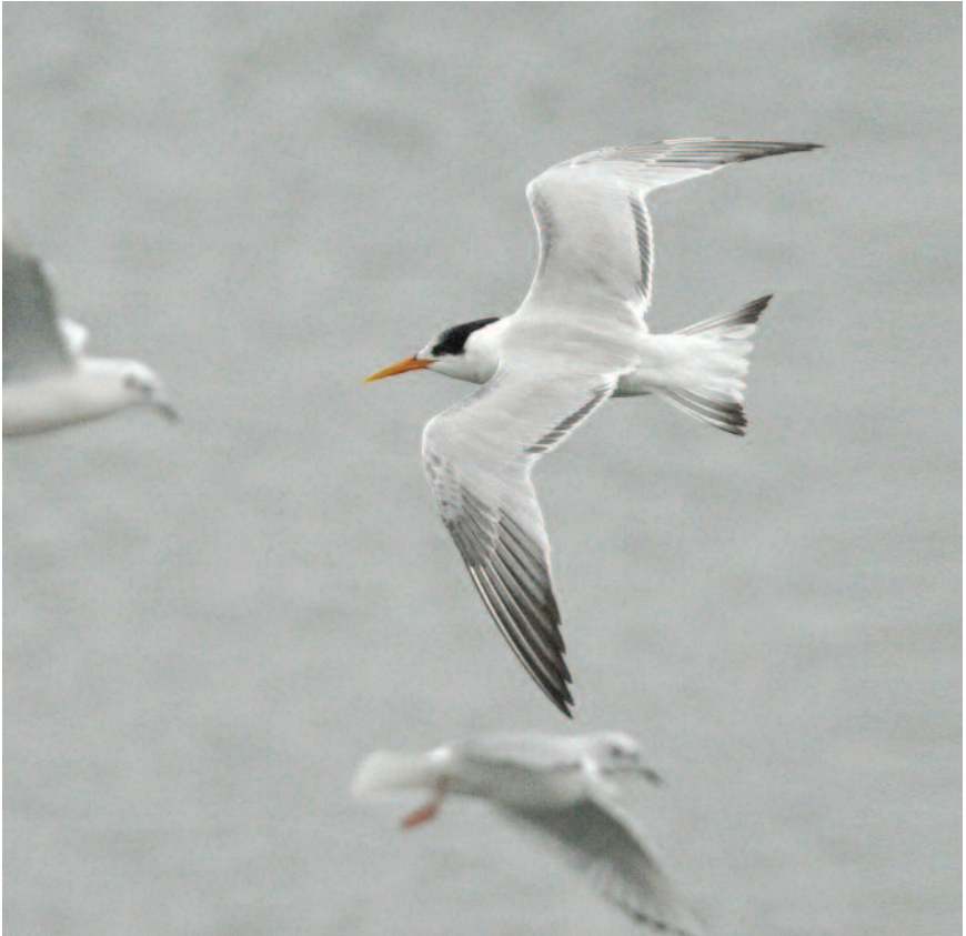
Figure 9: Elegant Tern, Buffalo, New York, on 21 November 2013. This same individual provided the first Ontario record when it crossed the river into Canadian waters.