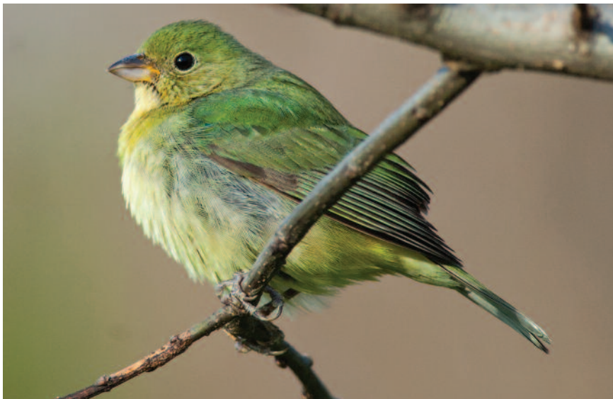
Figure 17: Painted Bunting, Sturgeon Creek, Essex on 29 April 2013.