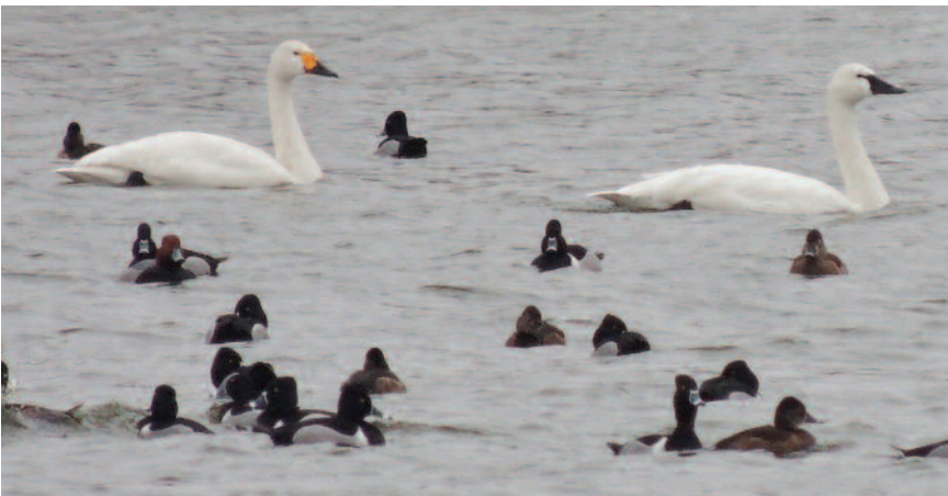
Figure 2: “Bewick’s” Tundra Swan (left) with “Whistling” Tundra Swan (right), Ridgetown, Chatham-Kent on 15 March 2013.