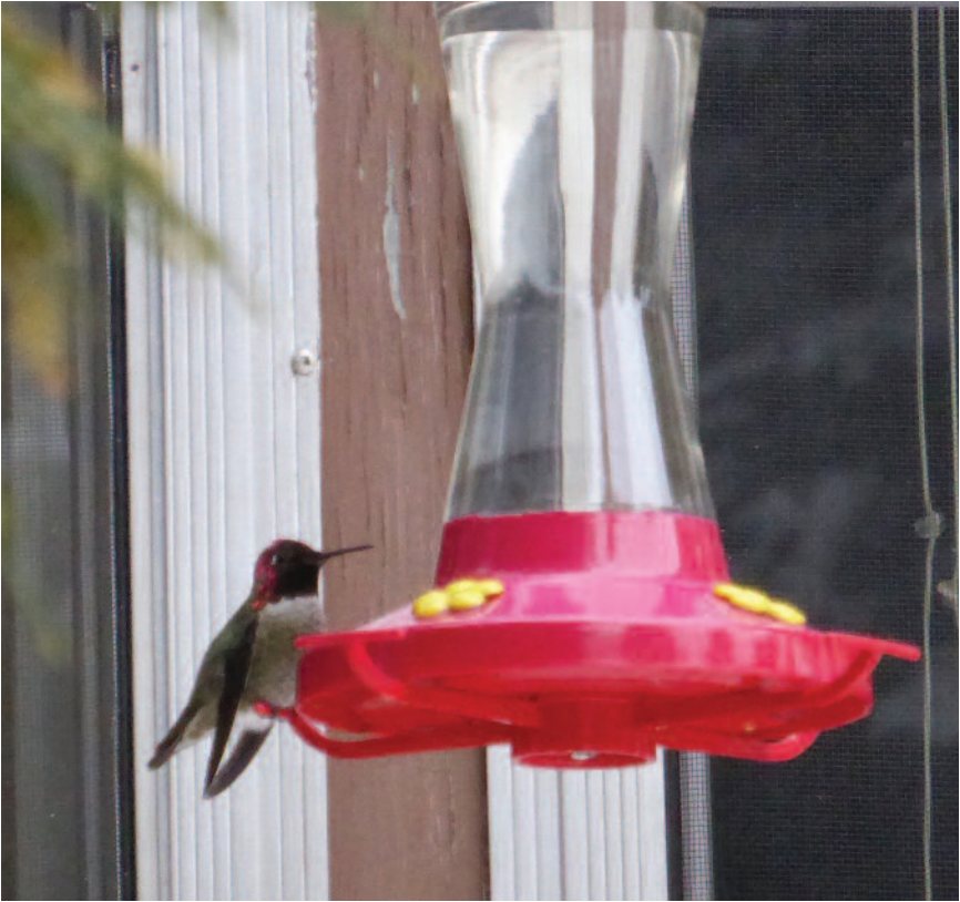
Figure 10: Anna's Hummingbird, Thunder Bay, Thunder Bay on 3 December 2013.