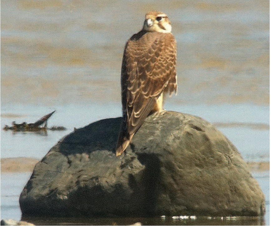
Figure 11: Prairie Falcon, Little Piskwamish Point, Cochrane on 2 August 2013.