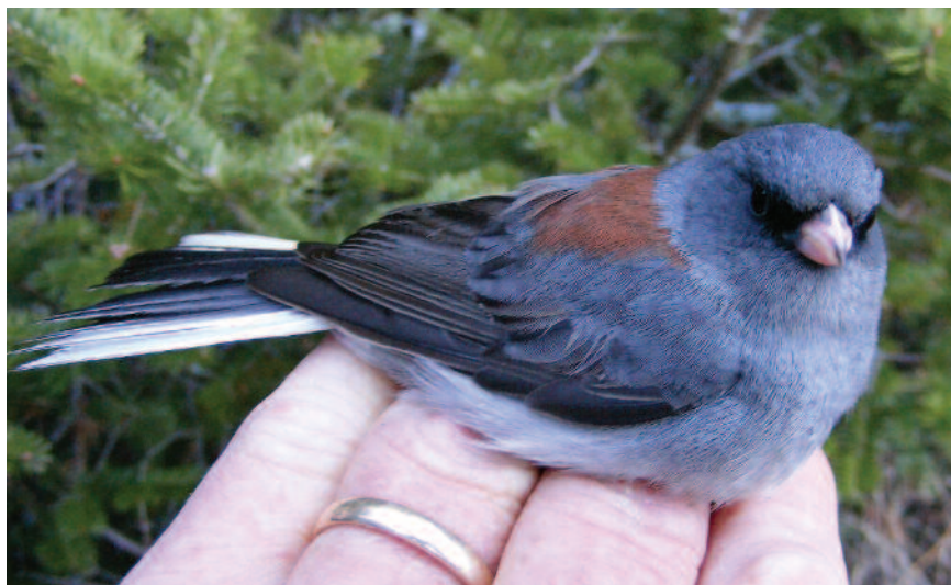
Figure 15: "Gray-headed" Dark-eyed Junco, Thunder Cape, Thunder Bay on 15 May 2013.