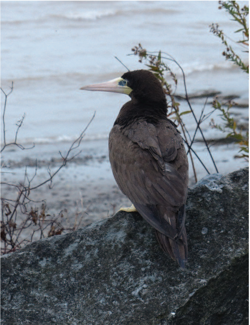
Figure 3: Brown Booby, Lowbanks, Haldimand on 2 November 2013.