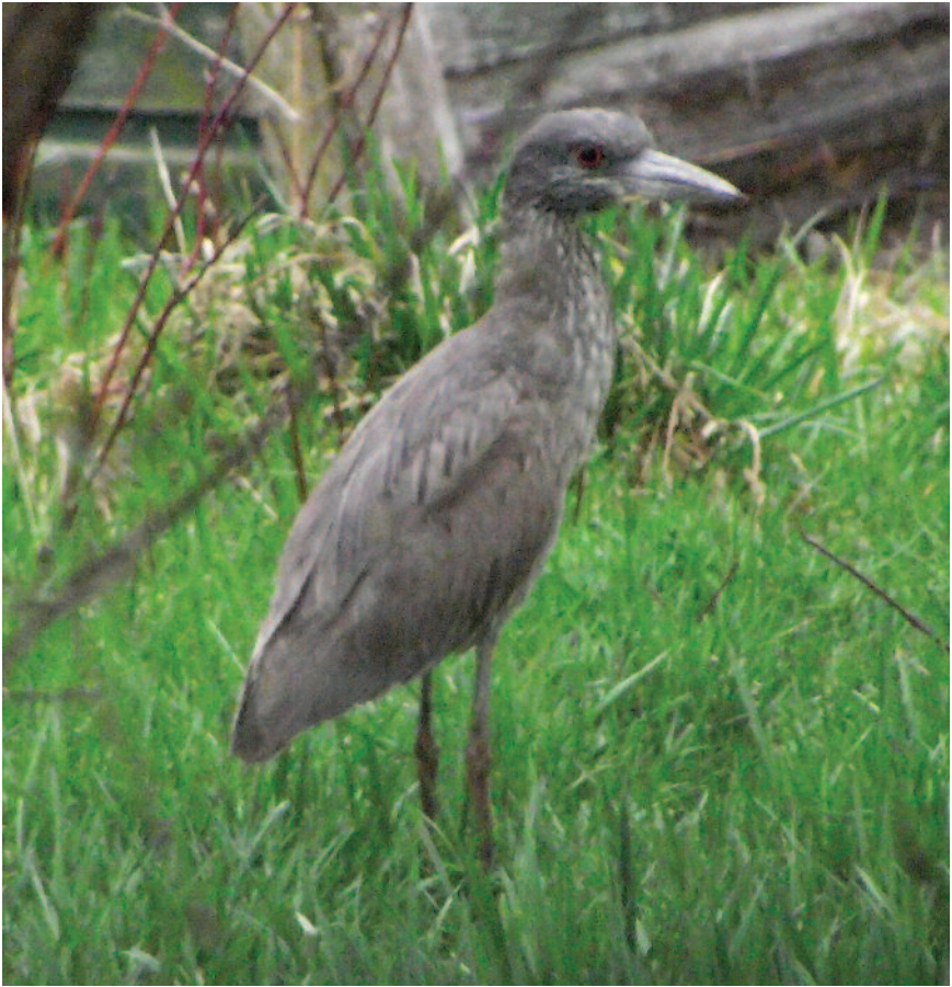
Figure 5: Yellow-crowned Night-Heron, Lindsay, Kawartha Lakes on 30 April 2013.