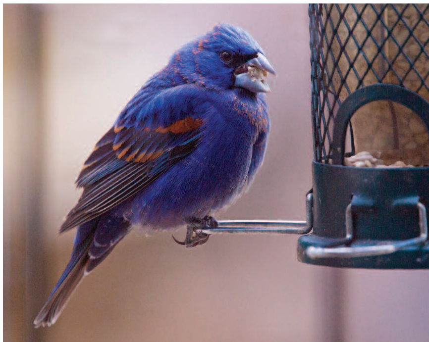
Figure 16: Blue Grosbeak, Windsor, Essex on 20 April 2013.