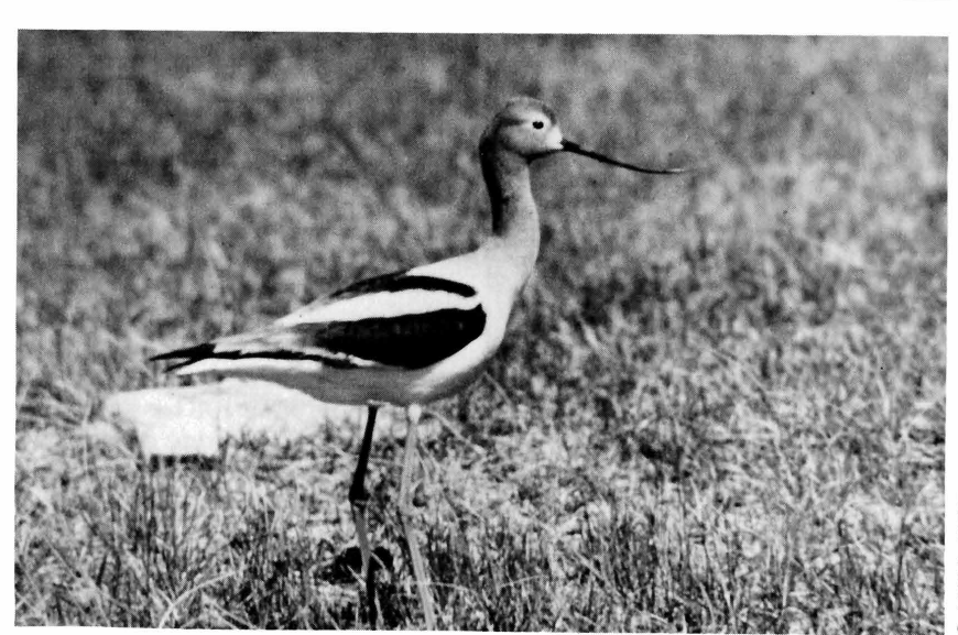
American Avocets have been found on Sable Island.

North on Hwy 600 (3.2 km) you'll come to River Road. This is the beginning of a 30 km loop which leads west to the Rainy River and then north through various habitats before turning back east to rejoin Hwy 600. Go west on River Road (1.6 km) and you will pass an ill-defined