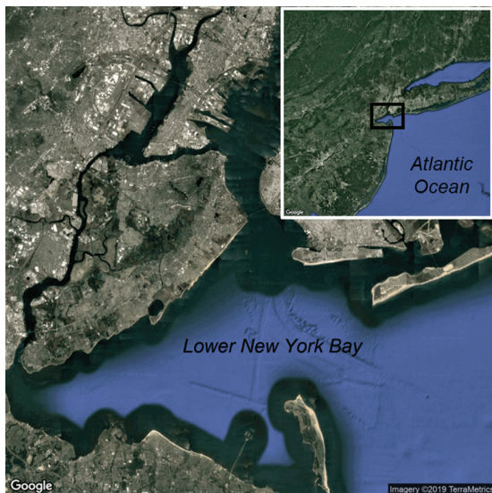
Fig. 1. The Lower New York Bay, the southernmost waterbody in the New York–New Jersey Harbor Estuary.

The Lower New York Bay (hereafter “lower bay”) is the southernmost waterbody within the heavily urbanized New York–New Jersey Harbor Estuary (Fig. 1). The lower bay is a near-marine environment that feeds directly into the Atlantic Ocean between the Rockaway and Sandy Hook peninsulas (Waldman 2013). Winter salinities range from 18.4 to 30.9 parts per thousand, with the lowest salinities recorded near the shores of Staten Island and Brooklyn, New York, and along the New Jersey shoreline (Cerrato et al. 1989). The highest salinities are recorded off the Rockaway Peninsula, where the bay meets the Atlantic Ocean (Cerrato et al. 1989). Most of the lower bay does not exceed 10 m in depth, although the Ambrose Channel, which is the only major shipping lane into the Port of New York and New Jersey, has a dredged depth of ~50 ft (~15 m) (USACE 2012). Throughout the lower bay, bivalve mollusks like blue mussels Mytilus edulis and northern quahogs Mercenaria mercenaria are abundant, with northern quahogs reaching some of their highest local concentrations in the southern part of the lower bay (within the Raritan Bay; MacKenzie 1997).