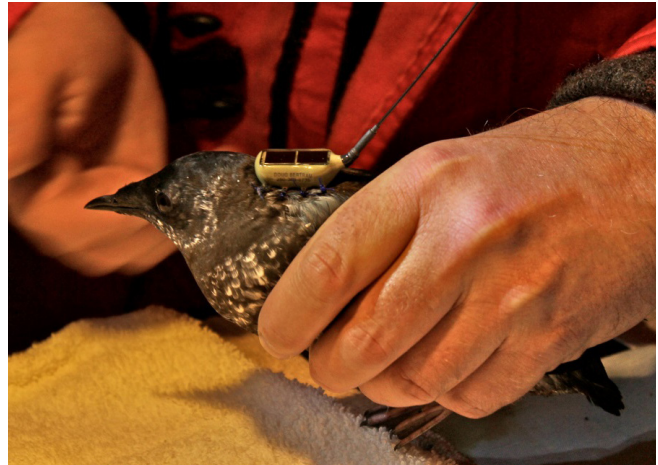
Fig. 1. Location of attachment of a 5 g solar satellite platform transmitter terminal (PTT) to a Marbled Murrelet on 18 April 2014 in Hartley Bay, BC, Canada.

algorithm over the traditional least-squares (LS) method is the ability to derive locations from as few as one transmission message (Lopez & Malardé 2011). This was an important advantage in our study, in which 33% of transmissions contained only one message, presumably due to a combination of behavioural and environmental (habitat) characteristics that obscured reception of the PTT signal by orbiting satellites (for example, incubation in dense forest cover and steep mountainous terrain). The resulting KF data were filtered using the Douglas Argos Filter (DAF; Douglas et al. 2012), available online through the animal tracking website Movebank ( www.movebank.org ). The DAF has been found to improve data accuracy by 50%–90% by removing implausible locations flagged