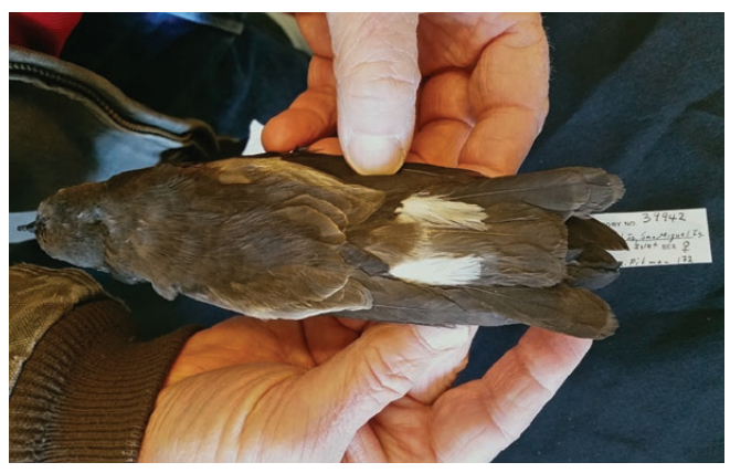
Fig. 3: Leach's Storm-Petrel (SDNHM #39942) captured by R.L. Pitman and S.M. Speich on 23 June 1976 at Prince Island, California.

Ainley (1980) and Power & Ainley (1986) reported two LESP specimens from the San Miguel Island area: SDNMH 39942 (Fig. 3) from PI in 1976 (rump score = 4) and USNM 544522 (Castle Rock; 14 May 1968; rump score = 10). USNM 544522 was later re-identified as an ASSP (see Carter et al. 2016a), and