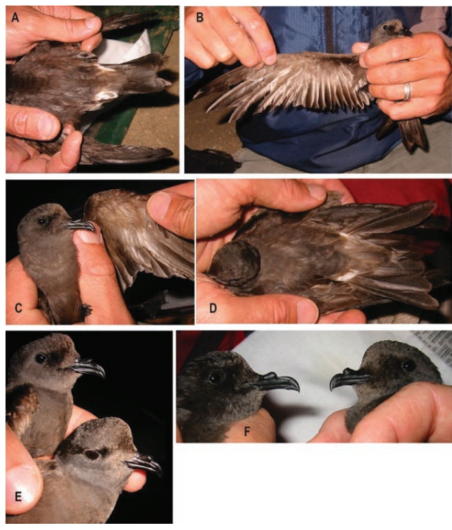
Fig. 2: Dark-rumped Leach's Storm-Petrels (LESP) and Ashy Storm-Petrels (ASSP) captured in mist-nets in the California Channel Islands: (A & B) LESP captured 16 August 2004 at Santa Barbara-Sutil islands (SBI) (rump score = 9), showing brownish underwing coloration; (C & D) LESP captured 18 August 2004 at SBI (rump score = 9), showing brownish underwing coloration; (E) LESP above and ASSP below captured 16 August 2004 at SBI, showing differences in bill shape and more posterior, longer and more pronounced gape in LESP; (F) LESP on left and ASSP on right, showing differences in bill morphology and more posterior extent of gape in LESP.

1977, 18 net nights were conducted between 28 May and 8 July at several locations around the island.