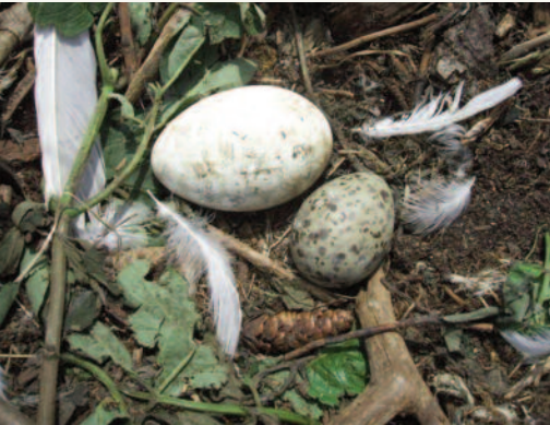
American White Pelican egg compared to a Ring-billed Gull egg.