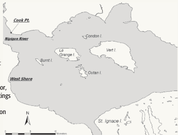
Figure 2. Nipigon Bay (Lake Superior, Canada) showing locations of sightings of adult American White Pelicans, 1999-2008 (See Table 1 for details on the sightings).

Upon leaving Granite Island, we visited the small low-lying island where the adult pelicans had settled during the time we were on Granite Island; no pelican nests were observed at that site. The adult pelicans departed from this island and returned to Granite Island where we observed them returning to the top mound, where the larger group of 17 nests was located. We did not observe pelicans