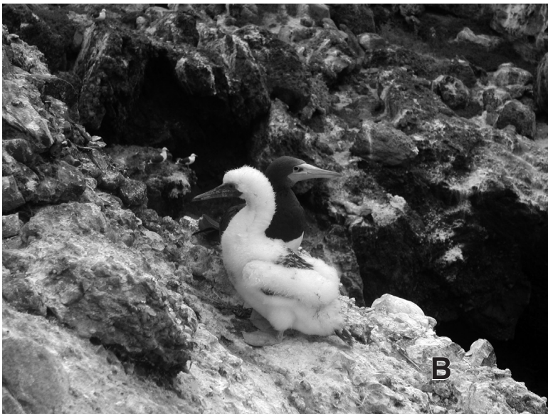
Figure 5. Downy Brown Booby chick in nest A at Middle Rock, Coronado Islands, in 2005: (A) adult male brooding chick on 18 April; and (B) adult female attending chick on 16 May, with nest material missing.