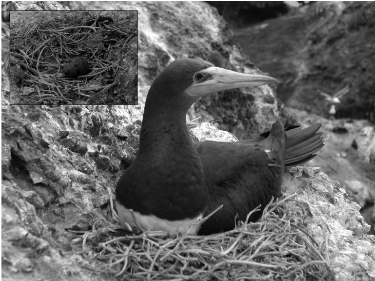
Figure 2. Adult female Brown Booby in incubation posture on Western Gull nest A at Middle Rock, Coronado Islands, 17 May 2002. Inset: Western Gull egg in nest.