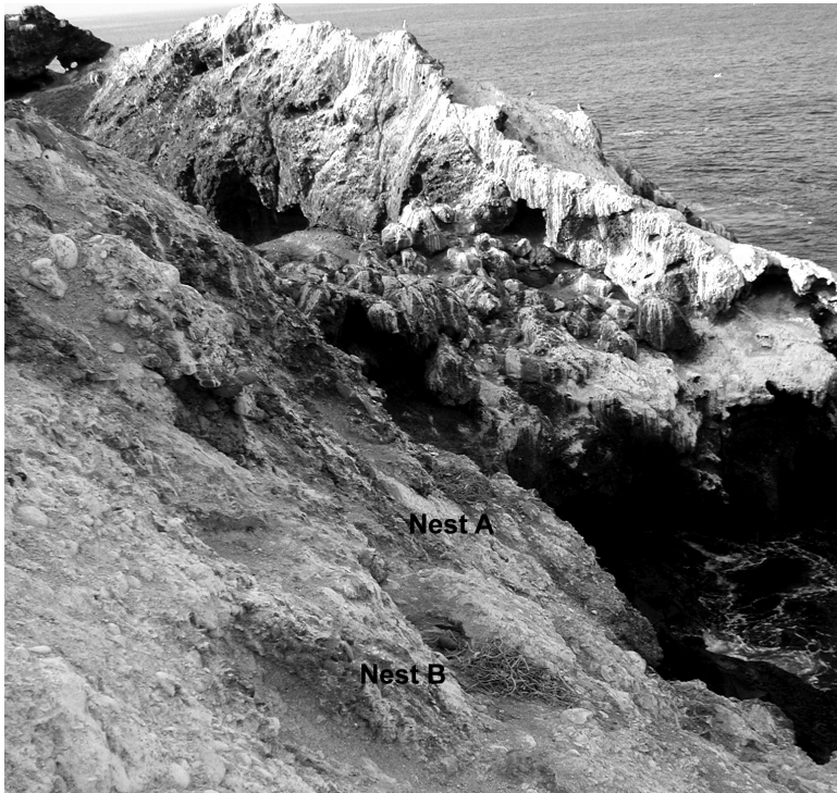
Figure 3. Two Western Gull nests attended by Brown Boobies at Middle Rock, Coronado Islands, 17 May 2002 (nest B foreground; nest A background).