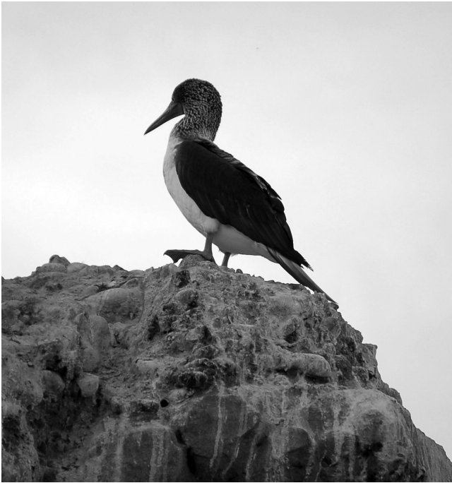
Figure 6. Adult Blue-footed Booby roosting at Middle Rock, Coronado Islands, 25 March 2007.