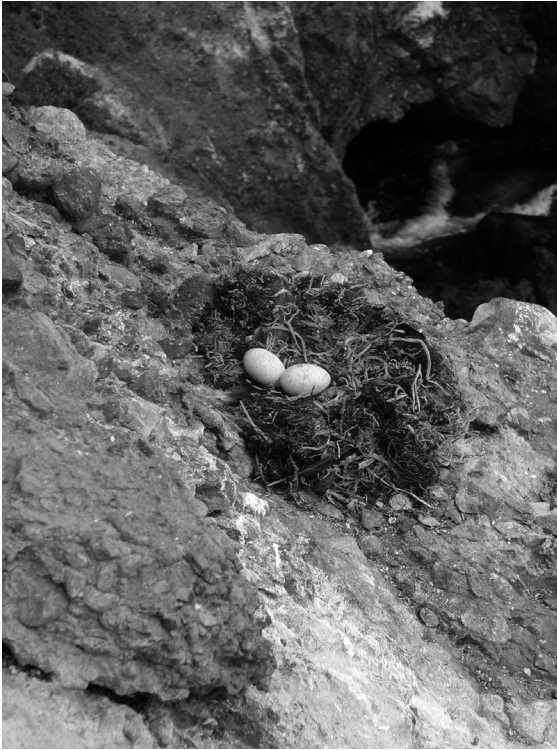
Figure 4. Two-egg clutch in Brown Booby nest A on Middle Rock, Coronado Islands, 24 March 2005.