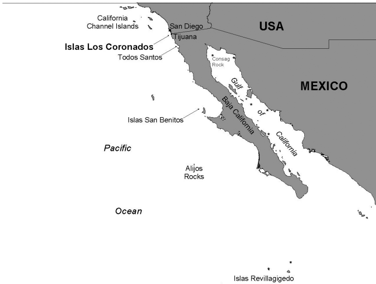
Figure 1. Location of the Coronado Islands off the northwest coast of Baja California, Mexico, in relation to principal breeding colonies (marked with asterisks) of the Brown Booby in northwestern Mexico.