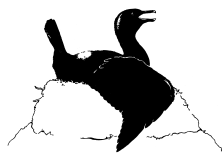
African Seabird Group