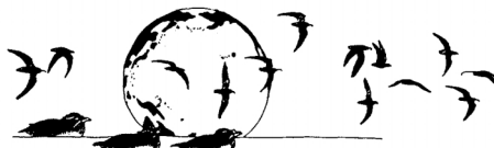
Pacific Seabird Group