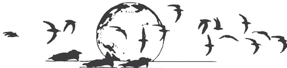
Pacific Seabird Group