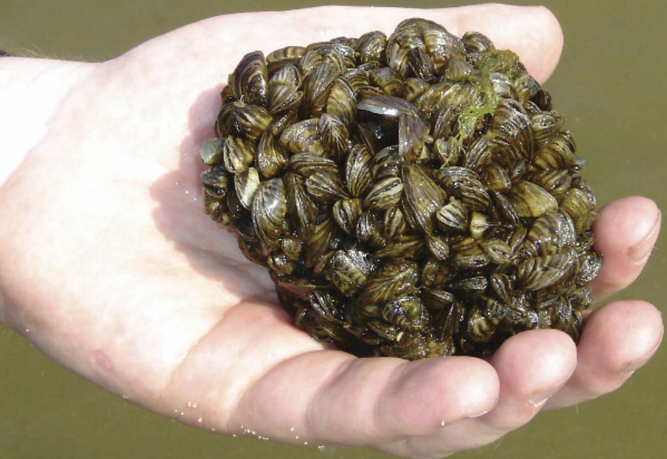
Figure 1. The non-native invasive Zebra Mussel (shown here) often has a distinctive zig-zag pattern on its shell, which is flattened on one side. By contrast, the non-native invasive Quagga Mussel (not shown) typically lacks the zig-zag pattern and has an all-rounded shell.

Over the past few decades, Lake Erie has been described as an environmental disaster, as well as a great conservation success. The health of the lake reached a low point in the 1960s and 1970s, but improved greatly by the 1980s (Makarewicz and Bertram 1991). Now, by contrast, we are hearing about harmful algal blooms, botulism, invasive species, climate change and other issues threatening Lake Erie water quality. The health of the lake is