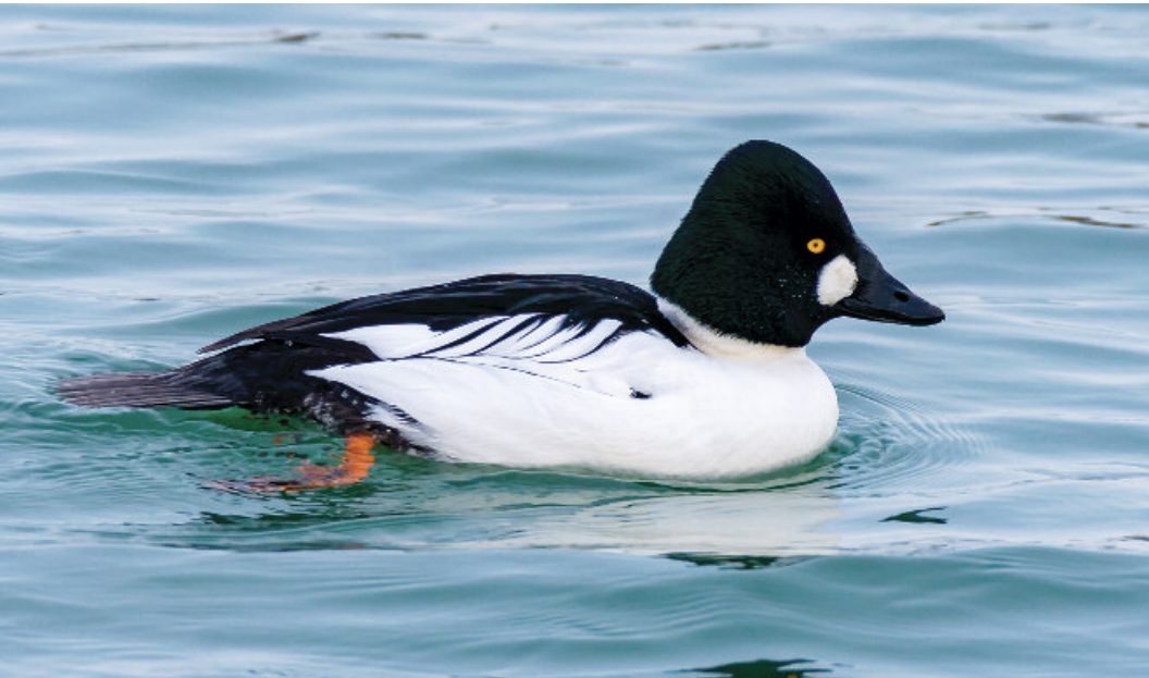
Figure 2. The Common Goldeneye is just one of several species of waterfowl that may have benefited from eating non-native Zebra Mussels and Quagga Mussels since they invaded Lake Erie and the rest of the Great Lakes. The mussels also indirectly benefit these ducks because various invertebrates that the birds are fond of eating are found at higher population levels amongst the mussels' shells. On the negative side, the mussels are a source of contaminants for the ducks, and sometimes a source of the lethal type-E botulism toxin.

around the mussel beds also benefit diving ducks, like Common Goldeneye (Figure 2), Long-tailed Duck, and especially Bufflehead, because they are particularly fond of eating the elevated numbers of shrimp-like crustaceans and midge fly larvae found amongst the mussel shells (Schummer et al. 2008a).