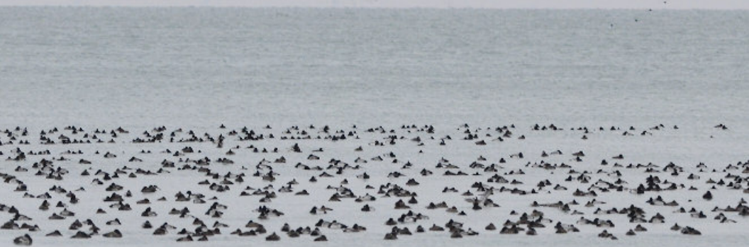
Figure 5. The number of staging and overwintering scaup (shown here) and other species of mussel-eating ducks has increased dramatically to hundreds of thousands of birds on Lake Erie since the invasion by non-native invasive Zebra Mussels and Quagga Mussels.

It is sobering to consider “what could have been” if the high levels of selenium that these birds ingest when eating the mussels were to seriously negatively affect their reproduction and survival.