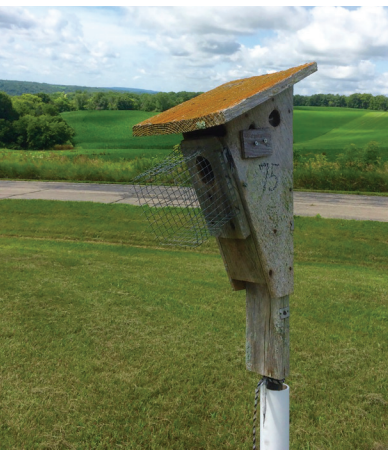
Figure 2. The Eastern Bluebird box in Black Earth, Wisconsin where the nestling banded in Nashville nested in 2016 as an adult.

This is the fifth record of an Eastern Bluebird banded in Tennessee encountered in another state, and the first encountered in Wisconsin (USGS 2016). Three were encountered in Alabama and one in Illinois (USGS 2016). Two of those Alabama birds