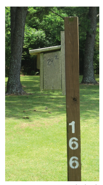
Figure 1. An Eastern Bluebird box at Percy Warner Golf Course in Nashville where the nestling was banded.

On 2 May 2016, #2251-20687 was captured by licensed bird bander Ann Wick. This female was incubating six eggs in nest box #75 in Black Earth, Dane County, Wisconsin (43.14138°, -89.70797°. Figure 2) approximately 822 km (511 miles) NNW of Nashville. At this time she was 5 years, 10 months old. The oldest known Eastern Bluebird lived 10 years, 6 months (USGS 2021), although most bluebirds (50 percent of adults, 75 percent of young) will die during a typical year (Pitts 2011). Five of the six