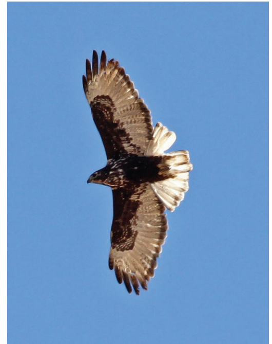
Figure 3. "Harlan's" Red-tailed Hawk, 20 January 2013.

There are several difficulties with this approach to analysis. The idea that cotton does not attract as many prey species as other crops is at this point still based on impressions rather than quantifiable evidence. We have no statistical knowledge as to which crops have the most food value per acre, which are subjected to the most pesticides, and which attract the most prey species or what those prey species are.