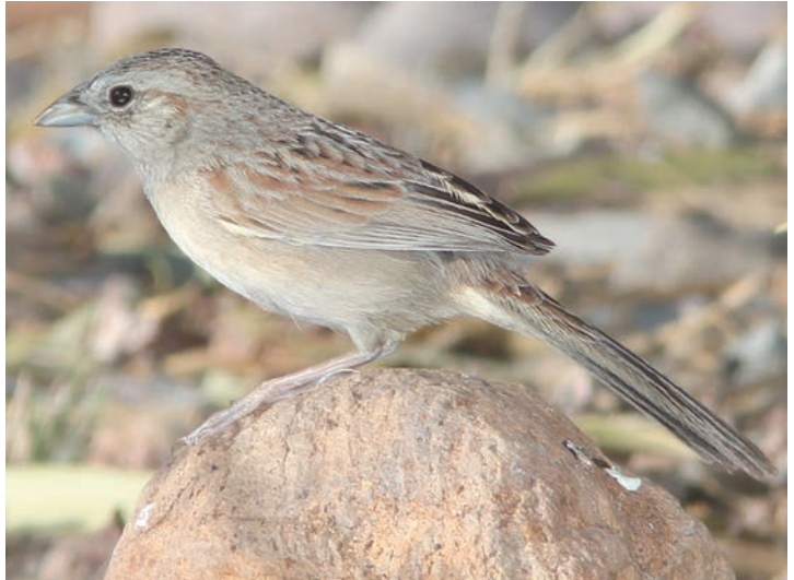
Figure 1: Adult Arizona Botteri's Sparrow, 9 Mar 2011. (Note that the crown color may look rufous, blackish or a mix at close range depending on lighting and viewing angle and wear.)

Most bird guides and other references suggest that "Arizona" Botteri's Sparrows ( P. b. arizonae ) withdraw south well into Mexico after the breeding season and do not return to Southeast Arizona until late spring (Webb and Bock 2012). However, in one recent reference several "accidental" winter records are listed (Tucson Audubon Society 2011). Furthermore, evidence by the author and other local birders suggests that in recent years this species lingers later into the fall, that at least some sparrows remain on or near their breeding grounds over the winter, and that their return in the spring may be earlier than had been previously published. The objective of this article is to review these winter and "out of season" records and to discuss possible explanations/implications of the findings.