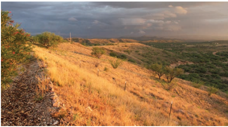
Figure 7: Feeding area at author's house; in gravel at left side of photo (looking south)