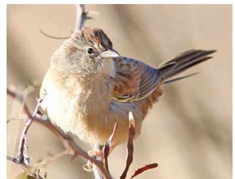
Figure 6: Adult Botteri's Sparrow in winter, 17 Dec 2012.