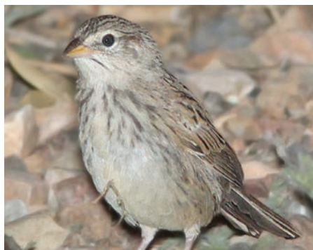
Figure 5: Immature Botteri's Sparrow, 21 Oct 2011