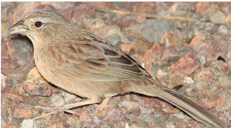
Figure 9: Botteri's Sparrow eating millet, 24 Mar 2011