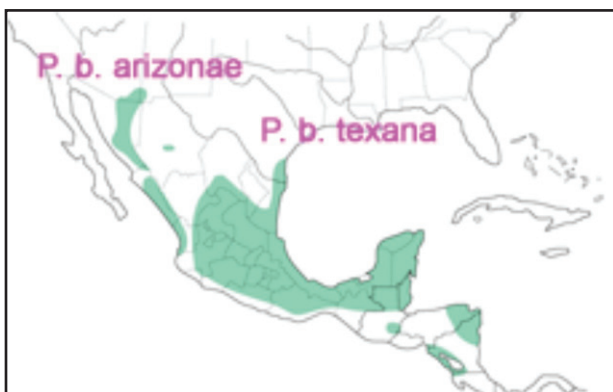
Figure 2: General distribution of Botteri's Sparrow, showing two subspecies known in USA.