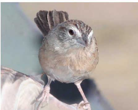
Figure 4: Botteri's Sparrow, 12 May 2011.

All observations in Table 1, except where noted, were made by the author at his residence, located on Circulo Montana, Patagonia Lake Ranch Estates, Santa Cruz County, AZ (Figs. 4-6). This is located between State Route 82 and Patagonia Lake State Park, on a ridge top at about 4200 ft (1280 m) elevation (GPS: 31.46584 / -110.85742 degrees). The habitat consists of rolling grasslands with somewhat widely scattered mesquite ( Prosopis sp.), ocotillo ( Fouquieria splendens ) and patches of low thorny shrubs. The area is lightly to moderately (and rather episodically) grazed by cattle and horses. There are scattered patches of relatively undisturbed grasses. The land rather steeply slopes on two sides of the property (Figs. 7 and 8). Most observations of non-breeding birds on the property were made at an area of flat gravel immediately adjacent to a steep, un-mowed grassy slope, referred to as the "feeding area" in the data (seen in Fig. 8). The preferred portion of a mixed wild bird seed product consumed appeared to be millet (Figs. 9 and 10), but one bird did consume milo on at least one occasion. Observations started roughly just after the author moved to this house in the summer of 2010.