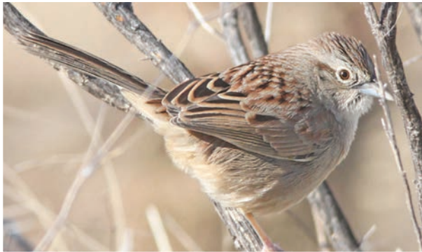
Figure 11: Adult Botteri's Sparrow in winter, 6 Jan 2013

Having seen several Botteri's Sparrows in the Patagonia Lake Ranch Estates area in late December 2012, the author decided to check the area more systematically. Starting at sunrise on the mornings of 6, 7, and 8 January he surveyed most of the established roads in the development, resulting in finding Botteri's Sparrows at 14 locations (17 birds; Fig. 11). The methodology of the study was as follows.