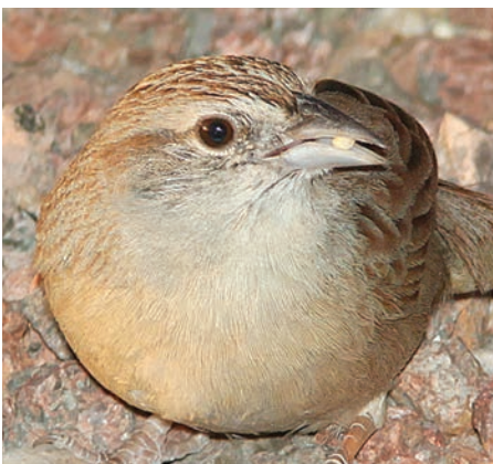
Figure 10: Botteri's Sparrow eating millet, 24 Mar 2011