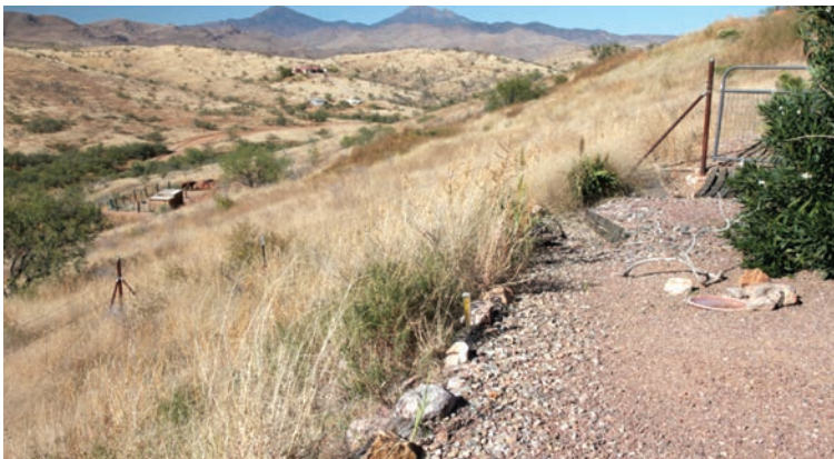
Figure 8: Feeding area at author's house; in gravel at far end of photo (looking north)