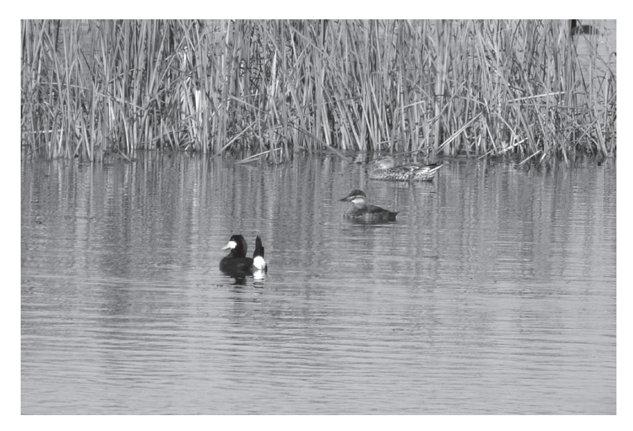
Figure 5. Ruddy Duck male with a duckling, about to bubble at a Northern Shoveler.

watch?v=jey9yMm3HPA)>. He performed the bubbling display near one of the juveniles, and the juvenile then bubbled, as though it were learning the display from him (video clip: <a href="https://www.youtube.com/watch?v=jD7GuIwpfxg">https://www.youtube.com/watch?v=jD7GuIwpfxg</a>).