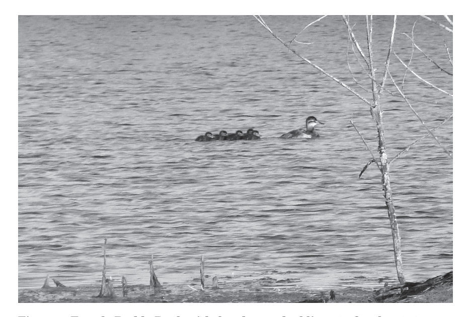
Figure 3. Female Ruddy Duck with five downy ducklings 19 October 2016.