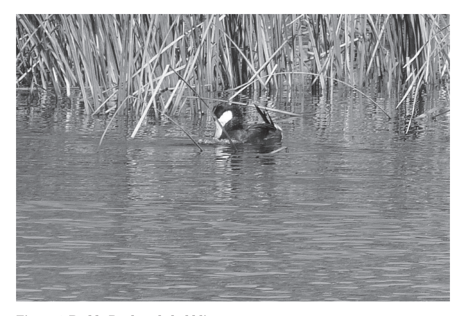
Figure 4. Ruddy Duck male bubbling.