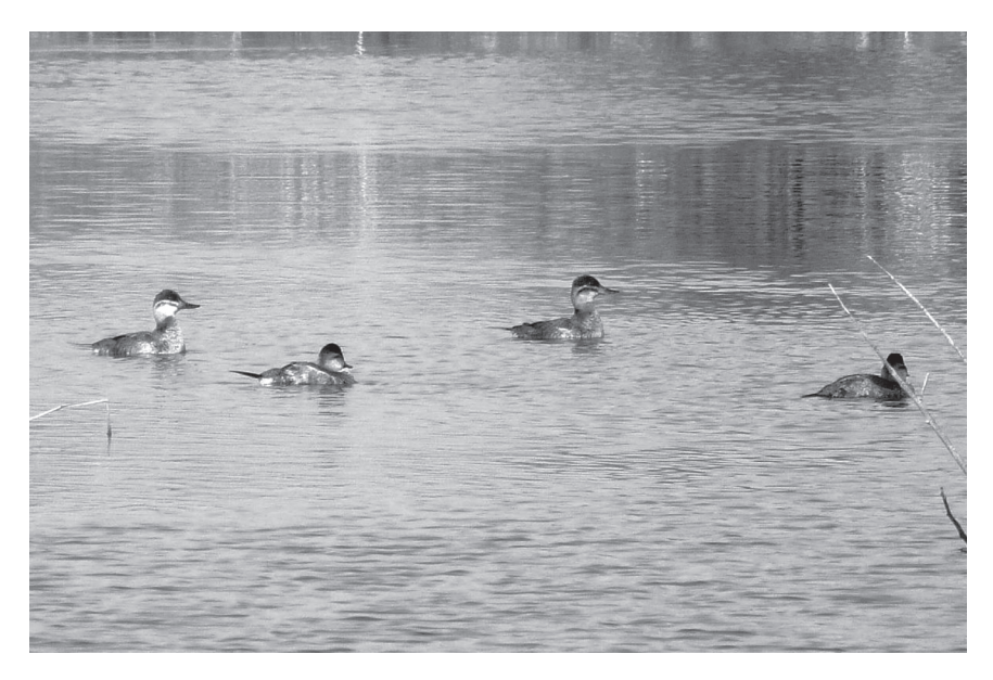
Figure 6. Three Ruddy Duck juveniles with the presumed mother (at left).

program. The salinity of the water in any given borrow pit can change dramatically depending on the volume of summer rains and the varying placement of the dredge slurry. Breeding sites on St. Croix have been on seasonal salt ponds (McNair et al. 2006), and previous breeding sites in Florida have included managed impoundments, phosphate pits, and an abandoned quarry. The continually changing geography and water content on this island may provide ongoing habitat for Ruddy Duck breeding, especially if bird monitors can help to manage work activities during nesting.