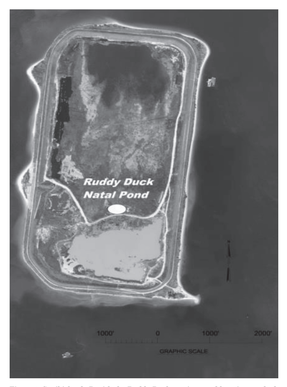
Figure 2. Spoil island 3D with the Ruddy Duck nesting pond location marked.

after a dredging project in 2015 and 2016, indicating that the water was relatively fresh. No water testing was done to collect quantitative data on salinity. The extent, depth, and connections of the pond are expected to vary with dredging work.