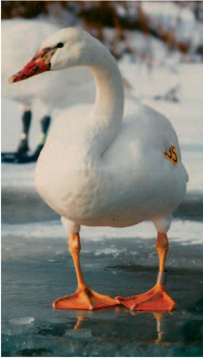
Figure 5. Leucistic Trumpeter Swan cygnet #395 in juvenile plumage on 22 January 1998, 7 months old.