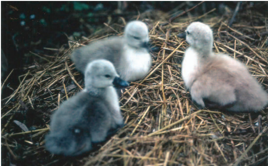
Figure 4. Two normal cygnets (left) and one leucistic (far right) Mute cygnet, newly hatched and still on the nest.

The parents of both Trumpeters and Mutes are remarkably sensitive to the colour of their newly hatched cygnets.