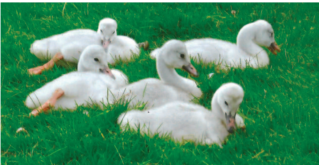
Figure 1. Five normal grey Trumpeter Swan cygnets in primary natal down, about four days old.

feet of subadult and adult leucistic Trumpeters in Yellowstone National Park. Banko (1960) found none at Red Rock Lake National Wildlife Refuge in Montana and leucistics do not seem to have been recorded in the Pacific population in Alaska.