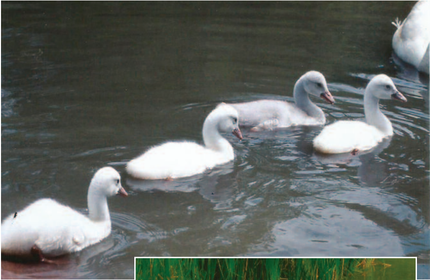
Figure 2. One normal (grey) and three leucistic Trumpeter Swan cygnets (white) in primary down about 10 days old.