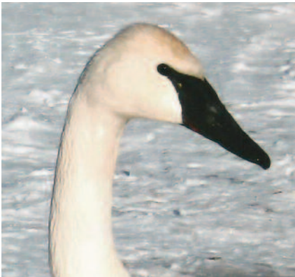
Figure 6. At 25 months, leucistic male C04 had yellow spots on the lores near the gape and at the nostrils. These markings were asymmetrical. A: right facing, B: left facing.