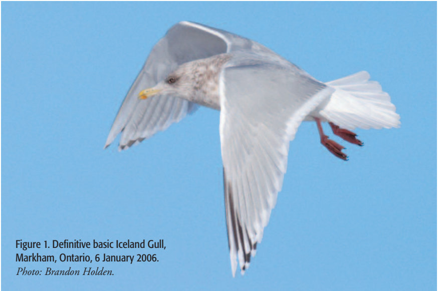
Figure 1. Definitive basic Iceland Gull, Markham, Ontario, 6 January 2006.

head-body molt beginning in late January and lasting until late April, resulting in first alternate (first summer) plumage. The complete second prebasic molt then commences in June and lasts until November on average, according to Grant. However, we can clearly see that the second prebasic molt starts in late April and early May, when the innermost primaries are shed, well shown in second calendar year Herring Gulls in Ontario. So where does a first alternate plumage fit in? Compounding this is the difficulty in determining how much of the extremely variable appearance of large second year gulls is due to the effects of wear and fading, as well as molt. Adding to this conundrum are gulls returning north from southern coastal areas with extreme bleaching effects of sun and sand abrasion. Perhaps through all of this confusion, it is best to keep in mind that a