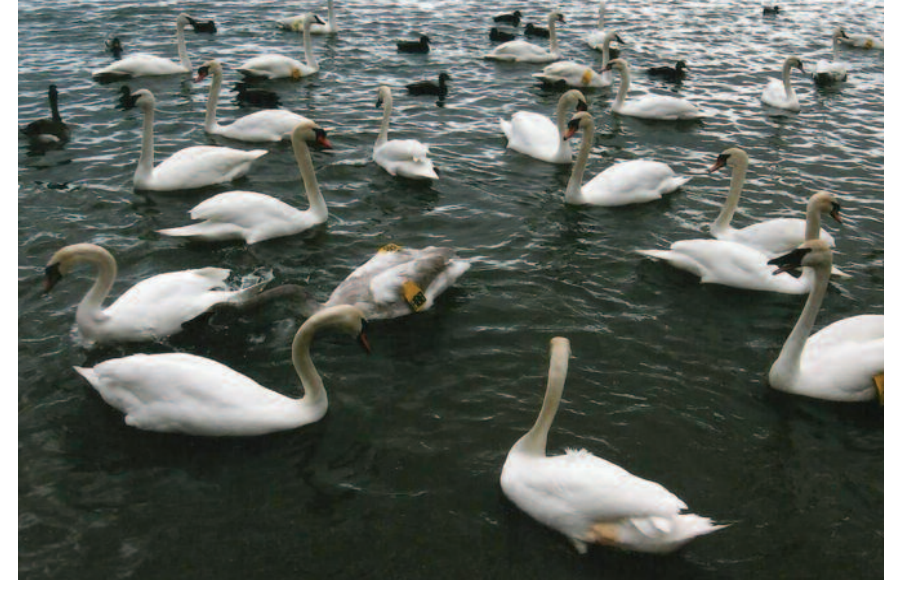
Figure 2. A mixed group of Trumpeter Swans and Mute Swans at LaSalle Park, Burlington, Ontario, on 22 March 2011. The trumpeter cygnet with yellow wing tag H88 is attacking an adult Mute Swan.

The attacks of both species were very brief, amounting to a single peck. Pecks by mutes were directed at the head of an opponent. The aggressor usually missed but sometimes gripped the neck of the opponent. In contrast, trumpeters directed their attacks at the body of the victim (Figure 2).