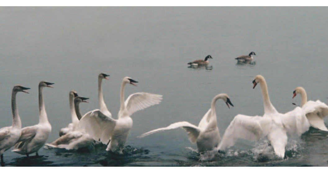
Figure 1. A Trumpeter Swan family confronts two Mute Swans at LaSalle Park, Burlington, Ontario.