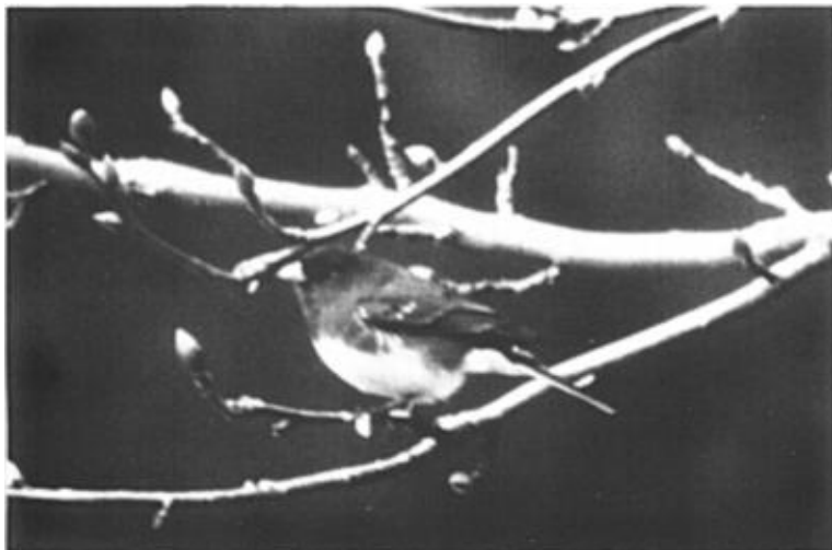
Figure 1. White-winged Junco ( Junco [hyemalis] aikeni ) at San Rafael, Marin County, California, 28 January 1991.