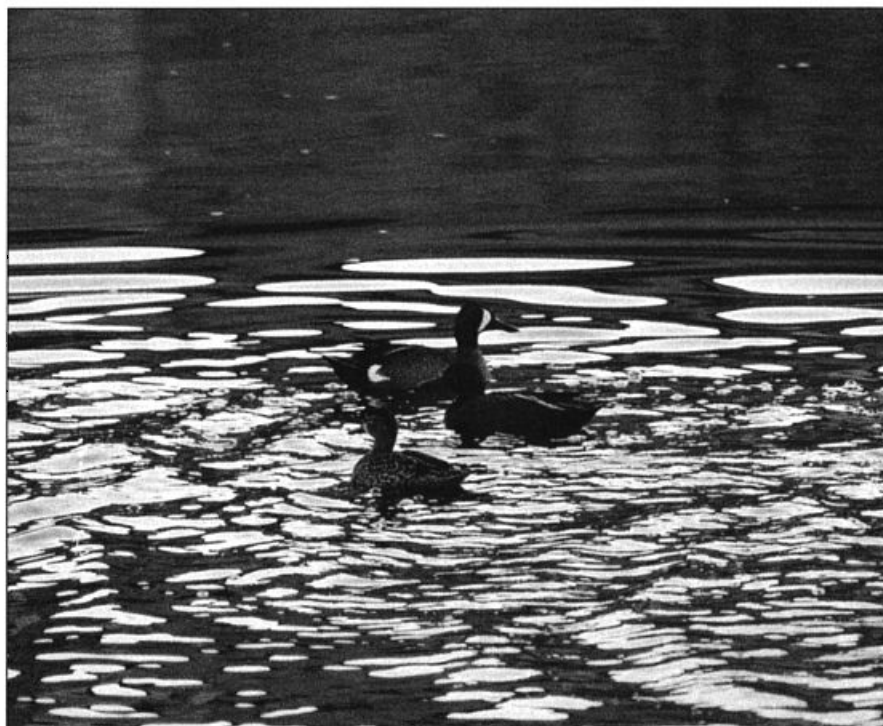
Farther east than usual was this male Cinnamon Teal (center, with Blue-winged Teal) in New Orleans, Louisiana, on February 8, 1998.