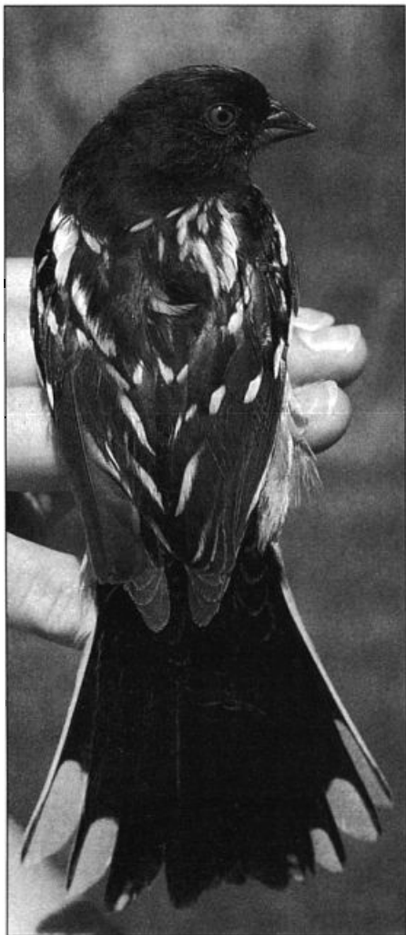
Notably far east was this Spotted Towhee at Baton Rouge, Louisiana, on February 23, 1998.