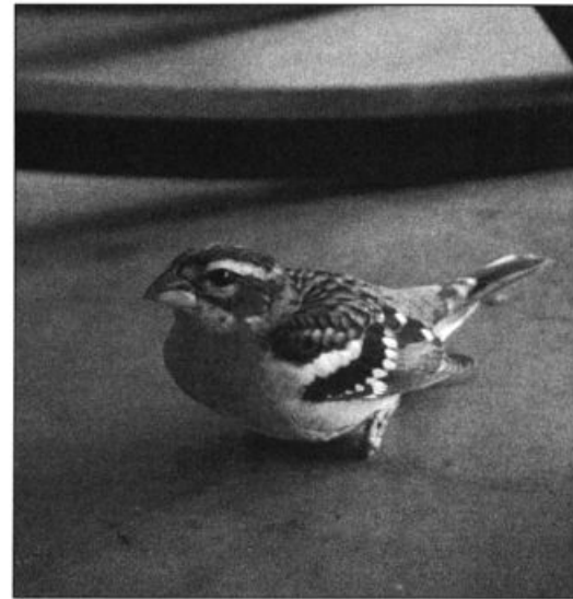
Relaxing on the porch in Lafayette Parish, Louisiana, on January 29, 1998, this immature male Black-headed Grosbeak was rare for winter and unusually far east.

Second locally in winter, a Bachman's Sparrow visited Winston , MS, Jan. 2 (GS, SK). Fifteen Am. Tree Sparrows wintered in Lake , TN (JRW), a traditional site. A Clay-colored Sparrow was well studied on the Gulf Shores CBC in Baldwin , AL, Jan. 3 (RAD, LRD, WWD). The Lark Bunting first noted in Jefferson , LA, last November lin-