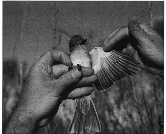
Two views of a Brown-crested Flycatcher at Delta National Wildlife Refuge, Louisiana, on February 24, 1998. It was identified as representing the race cooperi (normally found as close as southern Texas and eastern Mexico), not quite as large nor as large-billed as the race magister from the southwestern United States and western Mexico. Note the pattern of darkness on the outer tail feathers as seen from below.

LA, in late February (PY, RK, TK). Less rare but still notable was a Com. Ground-Dove in Tunica , MS, Jan. 11 & 17 (JRW). Sixteen Rose-ringed Parakeets in Orleans , LA, during midwinter (BRu) provided modestly interesting news, but 128+ Monk Parakeets counted in Orleans/Jefferson , LA (BRu, m.ob.), during just one day—Jan. 24—including 9 sightings of nest building, may be cause for modest alarm, at least by those with exoticaphobia.