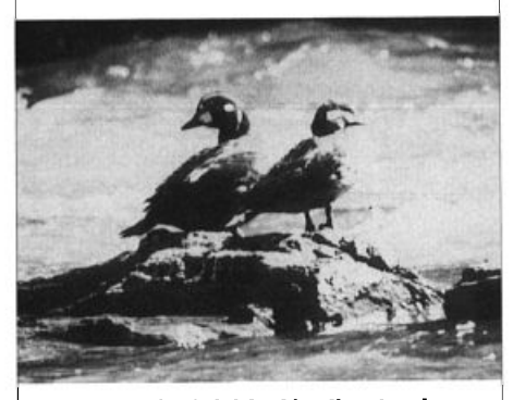
Remarkable for their inland location at such a southerly latitude were these two Harlequin Ducks at Sweetwater Creek State Park near Atlanta, Georgia, February 25, 1996.