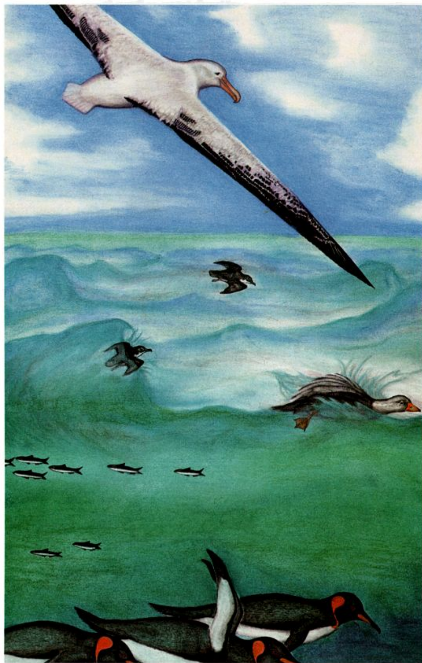
While the long-winged Wandering Albatross can take advantage of the lift created by updrafts on the windward side of waves, the Common Diving-Petrel zips right through the waves. In contrast, the Falkland Flightless Steamer Duck uses tiny wings to scoot across the surface, and flightless King Penguins torpedo themselves underwater with ease.

bined with the evolution of flightlessness—has been a major factor in the extermination of many bird species native to islands free of endemic land animals as soon as people introduced foxes, cats, rats, and so on.