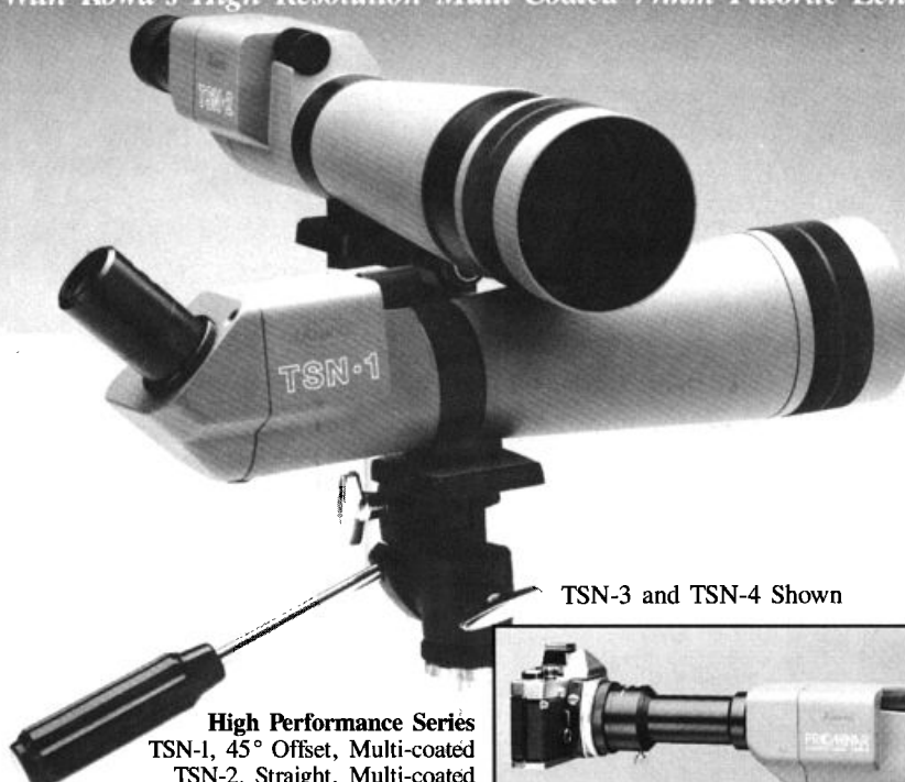
TSN-3 and TSN-4 Shown

With Kowa's High Resolution Multi-Coated 77mm Fluorite Lens!