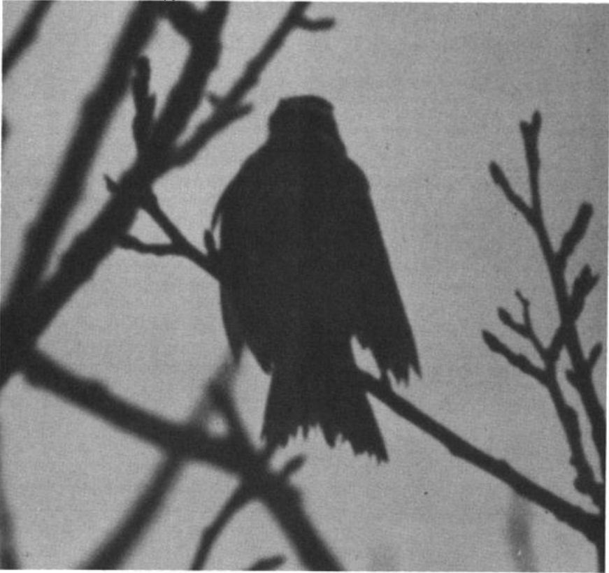
Variegated Flycatcher at Biddeford Pool, Me., in rain Nov. 8, 1977. Note emarginated inner webs of outer primaries, a character absent in Myiodynastes and Legatus .

but among some 220 Variegated Flycatchers the Biddeford Pool bird was perfectly matched by a number of specimens, and though a positive racial determination was not possible, probabilities favor the nominate race breeding in Argentina and Bolivia and migrating to northern South America. Of whatever race, the bird was certainly a Variegated Flycatcher, and a first North American occurrence.