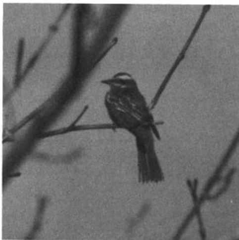
Variegated Flycatcher at Biddeford Pool, Maine, Nov. 11, 1977. Note faintly marked back, pale-edged wing coverts and secondaries. Color original shows rusty (paler here) upper tail coverts and edges of primaries and rectrices.

W E WERE UNABLE PROMPTLY to examine specimens at the Museum of Comparative Zoology and our first opportunity to do so was thus delayed to Nov. 15, when DWF visited the American Museum of Natural History. Here a quick look at Myiodynastes (big, "horse-headed" with heavy, broad bills and thick, wiry rictal bristles) was enough to exclude that genus,