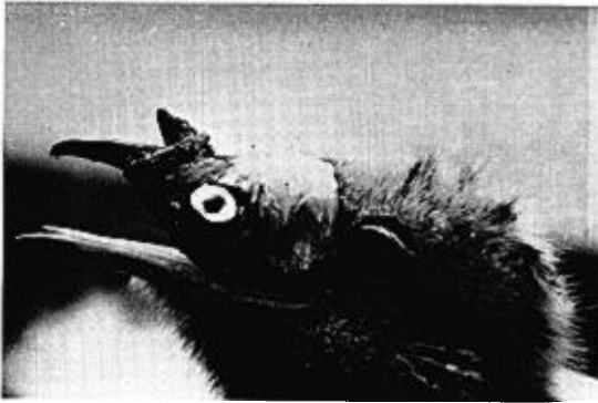
FIGURE 1. Common Tern chick with fish (probably Bluefish) impaled on upper mandible after tail-first swallowing.

trials, 2 of 39 were swallowed tail-first on the fourth and seventh attempts. By contrast, 33 of 62 tail-trials resulted in fish being swallowed head-first. This difference, tested by a Chi Square on a 2 \times 2 contingency table is highly significant ( P < 0.0001 ).