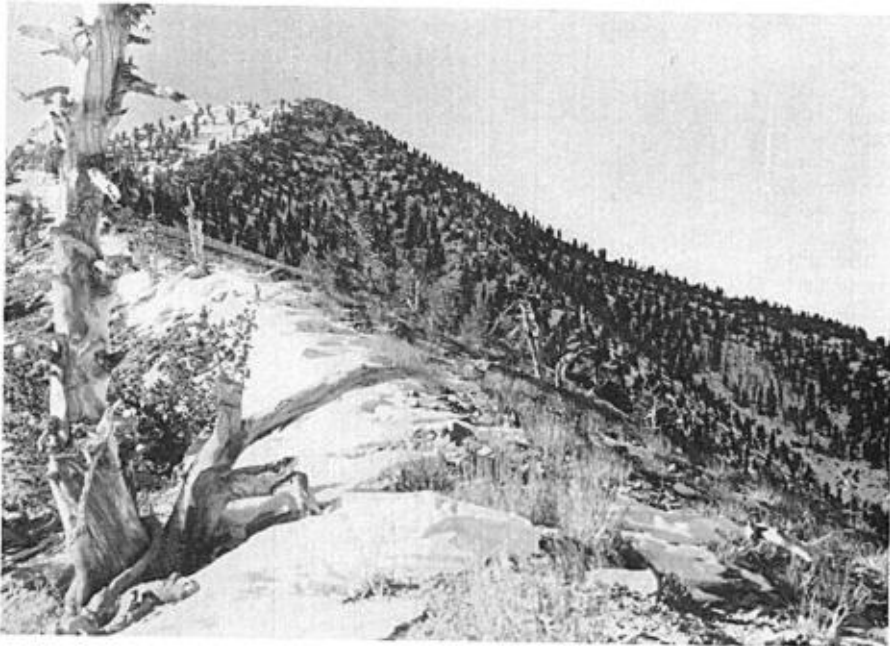
Fig. 6. A bristlecone pine forest is present on the upper slope of Telescope Peak, at an elevation of 11,049 feet. Snow may remain for nine months of the year along the high ridges.

On June 9, 1960, I surveyed a track of piñon woodland along the eastern slope of Roger's Peak, south and below Mahogany Flat, at 7800 feet elevation. An area approximately one-quarter mile square was covered by zig-zagging back and forth, following contour lines of the Telescope Peak Quadrangle. Eight species of birds were observed and six were considered to be nesting: Gray Flycatcher (12 pairs; nests situated 15 to 25 feet above the ground in piñons), Mountain Chickadee (16 pairs; a few nests in cavities in piñon and one in a mountain mahogany), Blue-gray Gnatcatcher (8 pairs; 5 nests well hidden among the branches and lower portions of piñon trunks), Black-