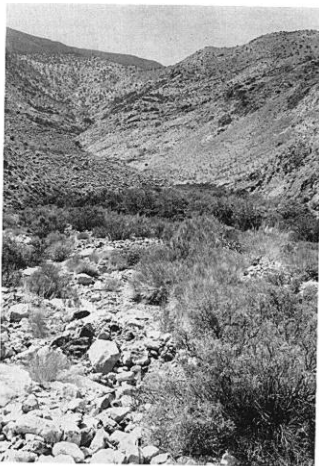
Fig. 3. Hanaupah Spring presents a luxurious growth of willows and seepwillows. The spring areas are heavily utilized by birds throughout the summer months.

This species appears to nest far from available water. Grinnell (1923:71) suggests that they are probably "able to go entirely without water, even in the hottest summer, save for such as may be secured along with its insect food or elaborated during the process of metabolism." I have many mid-summer records from places many miles distant from the nearest known water. Say Phoebes nest at low elevations after early March and in the higher portions of their range in May and early June. Immediately after the nesting season ends, the species becomes quite rare and apparently vacates its nesting grounds for a few to several weeks, returning in mid-summer or early fall. Such changes in abundance have been noticed in the summers from 1959 through 1962, both in the study area and in the below-sea-level region of Death Valley (Wauer, 1962).