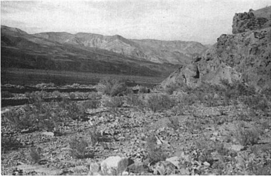
Fig. 2. Emigrant Canyon is typical of the habitat present in the low canyons. This zone of desert shrub is utilized by many birds in the spring and fall months, but birds seldom remain here during the hot summer days.

sus ), and creek senecio ( Senecio Douglasii ). A line of springs exist at about 4000 feet elevation throughout the study area which often support heavy growths of willow ( Salix ) and a few cottonwoods ( Populus Fremontii ).