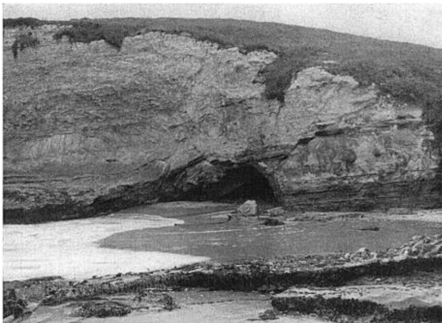
Fig. 1. Sea cave in which Black Swift nest was located near Santa Cruz, California.

It had been suspected that at least one of the parent birds was roosting in the cave with the young. Just before midnight on September 10, James Beck and I visited the cave. The night was exceedingly dark and a heavy, low fog shrouded the coast.