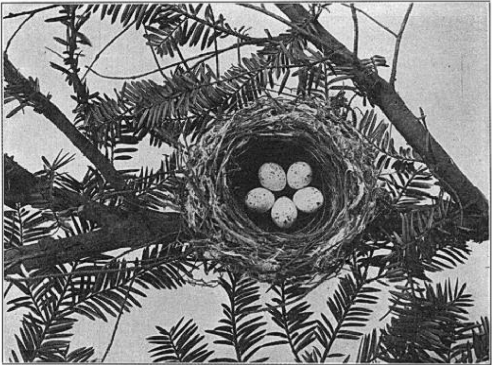
Fig. 27. NEST AND EGGS OF THE HERMIT WARBLER, THE RAREST OF THE SIERRAN WARBLERS. THIS NEST WAS SITUATED IN A YEW GROWING IN THE DENSE FOREST NORTH OF FYFFE. THE SET SHOWN IS THE FIRST TO BE FOUND CONTAINING FIVE EGGS.

Most of the day was spent in Webber Canyon, where a number of Western