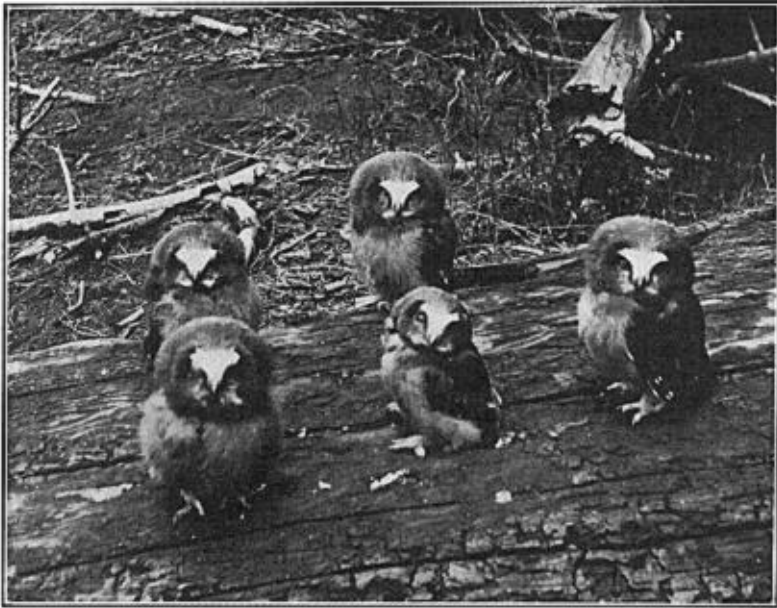
Fig. 30. YOUNG SAW-WHET OWLS FOUND MAY 20, 1913, IN WEBBER CANYON NEAR FYFFE. THIS CONSTITUTES THE FIRST DEFINITE BREEDING RECORD FOR THIS OWL IN CALIFORNIA.

The most agreeable surprise of the day was finding a nest of the Audubon Warbler ( Dendroica auduboni auduboni ) with two fresh eggs, in an apple tree eight feet up and close to the hotel. On May 21 this held four typical eggs, they being heavily and richly marked. In fact I believe the eggs of no other Californian warbler can show coloring as rich or markings as varied and heavy as those of this species. The nest was of rootlets, string (an indication of its nearness to the habitations of man), bark strips, and plant fibers, and was profusely lined