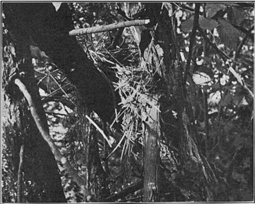
Fig. 28. NEST OF THE SIERRA HERMIT THRUSH, THE FIRST TO BE RECORDED FROM THE VICINITY OF FYFFE. NOTE THE LACK OF CONCEALMENT, A COMMON FEATURE OF THIS BIRD'S NESTING.

Most of May 16 was spent in canyons north of Fyffe. Leaving the latter place, which by the way is not a hamlet but merely a hotel and postoffice, I came upon my first pair of Mountain Chickadees ( Penthestes gambeli ). Judging from the records of previous workers, these birds were unusually rare here the present season. Several times during the day I noted California Woodpeckers ( Melanerpes formicivorus bairai ) as not uncommon, although Barlow does not record them for Fyffe. Two days before, I observed a pair of Red-breasted Sapsuckers ( Sphyrapicus varius ruber ) hollowing out a home in a lofty dead branch overhanging a ditch. Passing the spot now I found them still engaged in the work. While not rare anywhere I found Western Wood Pewees ( Myio-