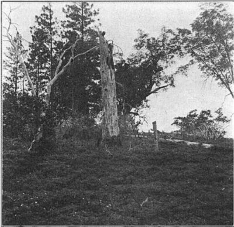
Fig. 29. NESTING SITE OF THE SAW-WHET OWL ON A RATHER OPEN HILL SLOPE IN WEBBER CANYON, SOUTHWEST OF FYFFE. THE CAVITY OCCUPIED WAS FOURTEEN FEET ABOVE THE GROUND IN THE LARGE STUB IN CENTER OF PICTURE. "MOUNTAIN MISERY" CARPETS THE FOREGROUND.

It rained hard during the night, and continued intermittently the next day (May 18), making the woods so wet that field work was not only unpleasant but