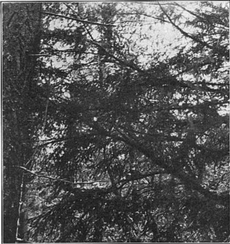
Fig. 26. THE MAZE OF FOLIAGE WHERE THE NEST OF THE HERMIT WARBLER WAS FOUND. THE NEST IS SITUATED IN THE CENTER OF THE PICTURE BUT IS TOO SMALL TO DISTINGUISH READILY.

The nest was saddled halfway out on a slender yew branch fourteen and a half feet up. From the nature of the foliage the situation was somewhat open, but partial concealment was given by branches above and below. The tree itself was one of wide spreading branches, about thirty feet in height, and standing in the almost perpetual shade of the lofty firs and cedars, which in endless numbers cover the gradual slope of the canyon's southern wall. Dark and damp,