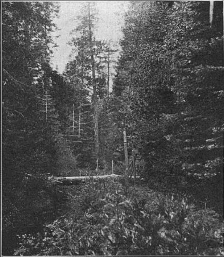
Fig. 25. IN THE FOREST AT FYFFE. THIS RATHER OPEN VIEW WAS POSSIBLE ONLY BECAUSE OF THE CLEARING ALONG THE DITCH; ELSEWHERE THE FOREST WAS GENERALLY SO DENSE AS TO PRECLUDE PHOTOGRAPHY. ON MAY 20 A NEST OF THE SIERRA JUNCO WAS LOCATED CLOSE TO THE LOG SPANNING THE STREAM.

It was not my original intention in the afternoon, in a sort of preliminary survey, to climb in traveling clothes the pitchy pines or charred dead tree trunks, but the ornithological temptations proved stronger than my resolutions. Edging on the road I noted four rich buffy eggs of the Mountain Partridge ( Oreortyx