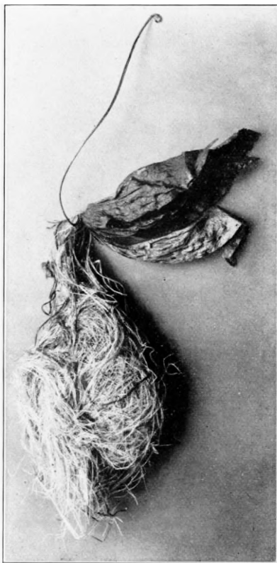
Fig. 19. NEST OF THE SLATE-HEADED TODY FLY-CATCHER, TODIROSTRUM SCHISTACEICEPS

Rhynchocyclus is a genus of small flycatchers of obscure coloring and ordinary habits, noteworthy only for their curious nests, which are perhaps among the most remarkable examples of protective adaptation known. The nest of R. cinereiceps is built from ten to thirty feet above the ground, or water, as it frequently overhangs a stream. In shape it resembles an old shoe, or rather moccasin, suspended by the top with the entrance at the toe, and a narrow passage leading over the instep to the heel, where the main cavity is situated. It is composed of some kind of aerial roots—long, fine black fibers resembling horse hair. It usually hangs from a long, slender branch of one of those myrmecophilous acacias, whose stout double spines are hollow and inhabited by ants. The thorns are very numerous and the ants are extremely irritable and armed with formidable stings, equal in effectiveness to that of the bumble bee. The thorns alone would make the ascent of the tree by an animal of any size very difficult, but the presence of the ants renders it absolutely impossible. But this is not all. A species of hornet frequently makes its nest, a large conical or oval structure, in the same tree, and