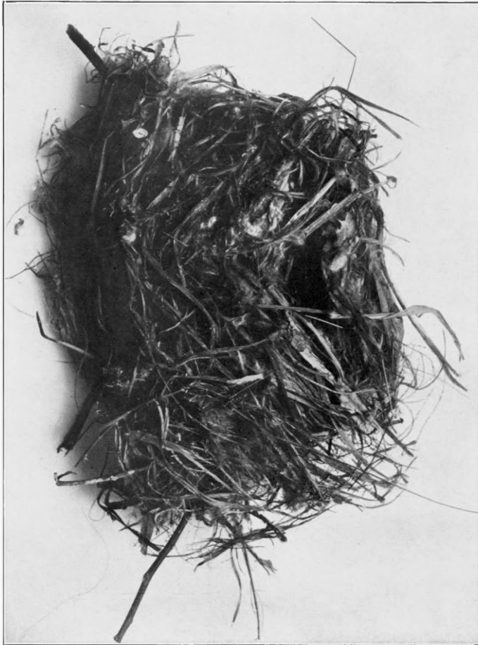
Fig. 20. NEST OF THE CINNAMON BECARD, PACHYRHAMPHUS CINNAMOMEUS

A few words may be added here regarding the relation of ants to the nesting habits of British Honduras birds. In several instances referred to their presence is employed by the birds as a means of defence from larger enemies, but they are by no means always beneficial. The writer once found a nest of Myiarchus