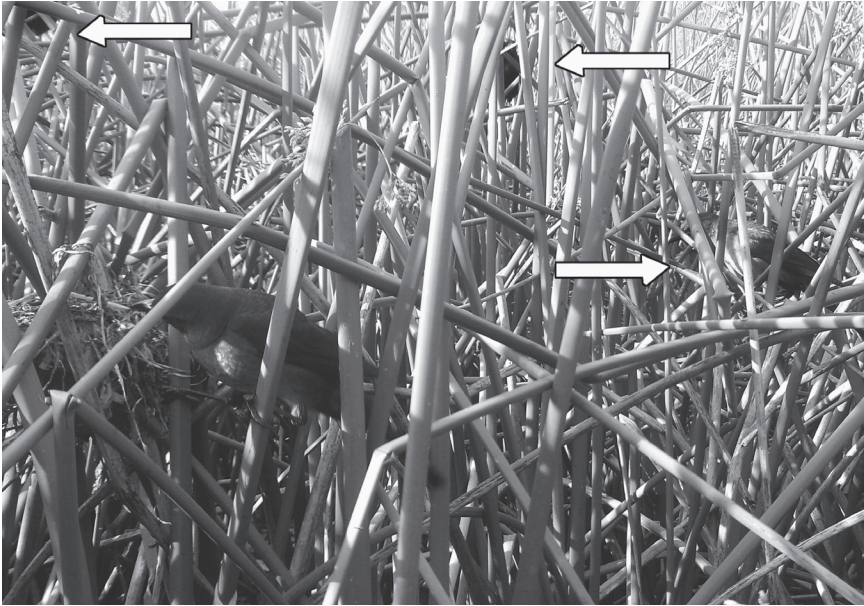
Figure 3. Female Boat-tailed Grackle disassembling blackbird nest 2011/7, attended by two other female grackles. A male grackle is barely visible in the upper left of frame at nest 2011/8. Crescent Lake Park, 12 March 2011.