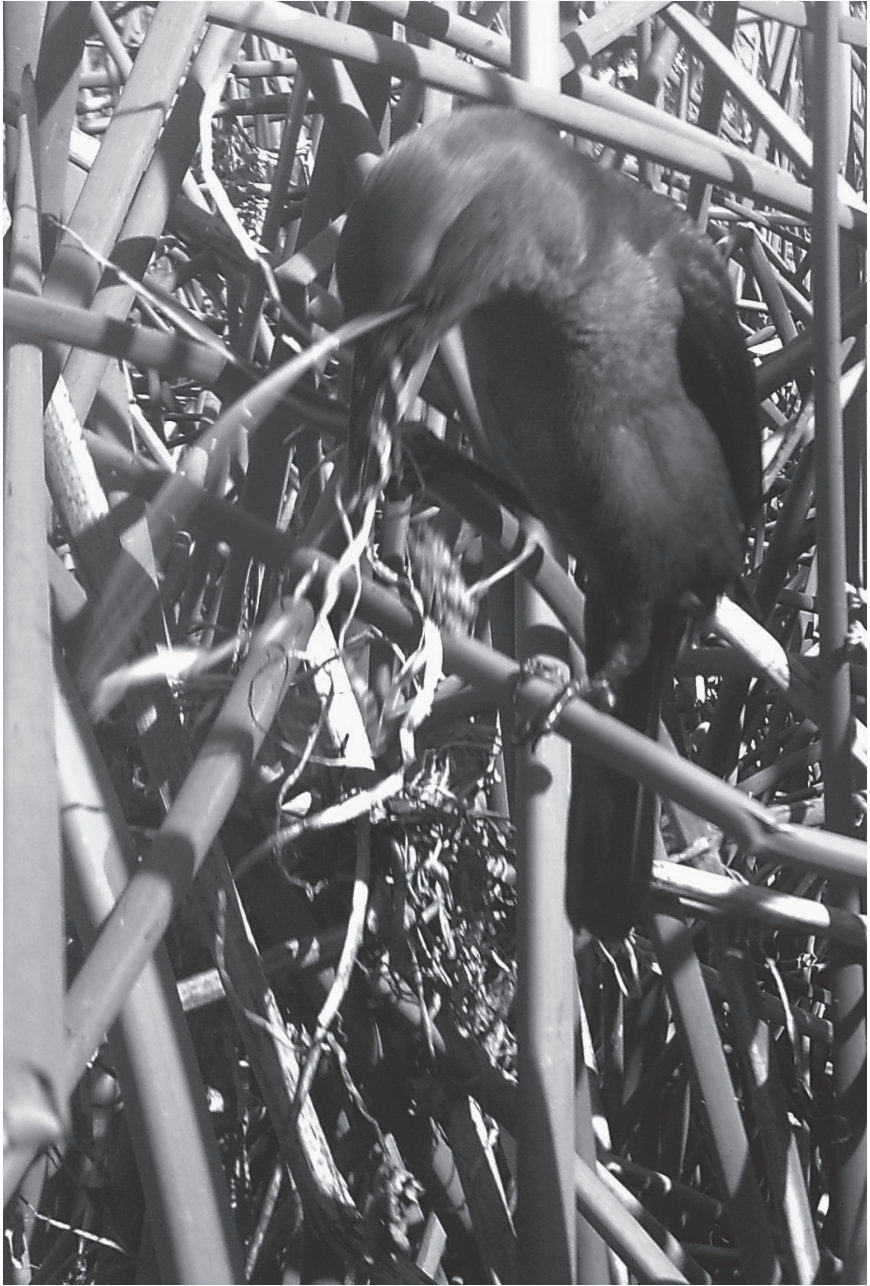
Figure 2. Female Boat-tailed Grackle removing material from blackbird nest 2011/7. Crescent Lake Park, 12 March 2011.